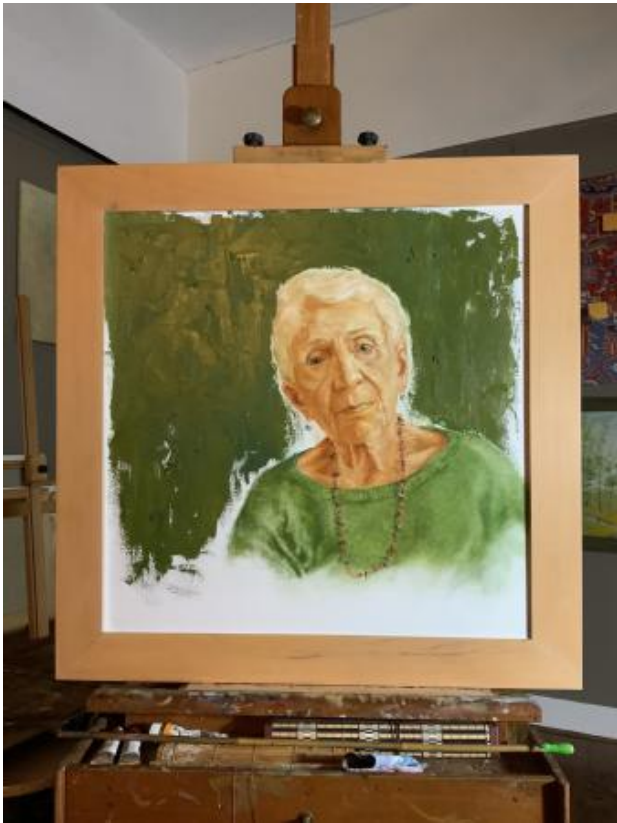
Mother , 2021 Oil on canvas , 70x70cm