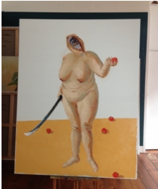
Eve 2, 2017 oil on canvas, 140x180cm