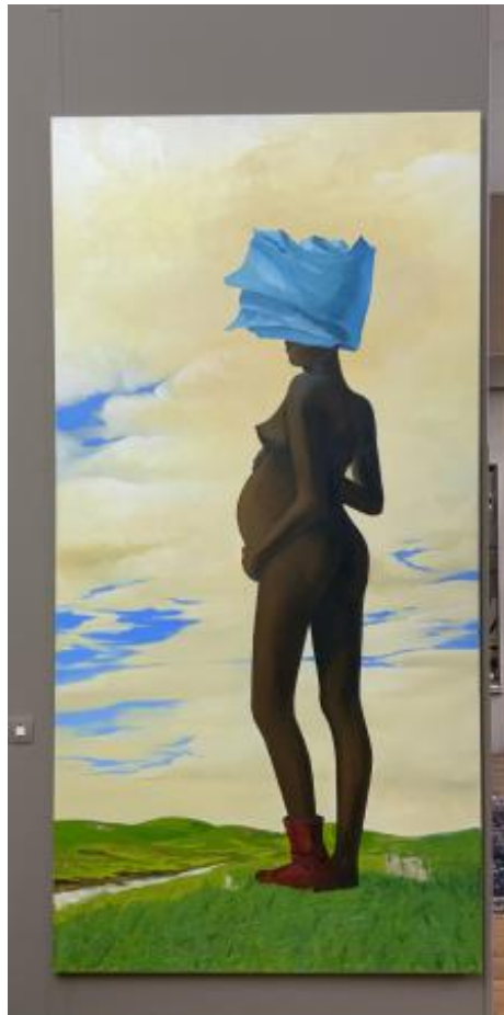
Dream , 2021 Oil on canvas , 100x200cm