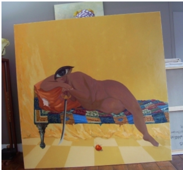
Eve 1, 2017 oil on canvas, 200x200cm