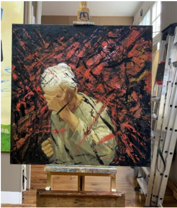
Furry , 2021 Oil on canvas , 120x120cm