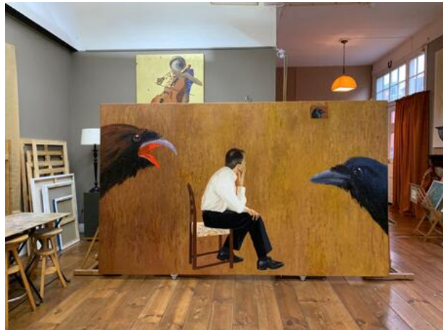
Thuggery, 2019 Oil on canvas, 180x300cm