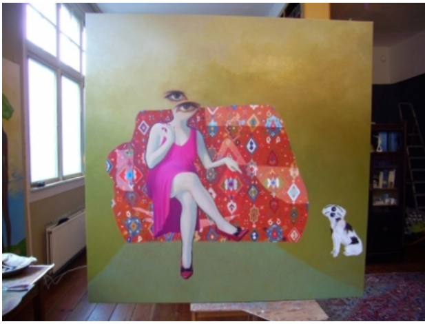
Outsider, 2015 oil on canvas, 200x200cm