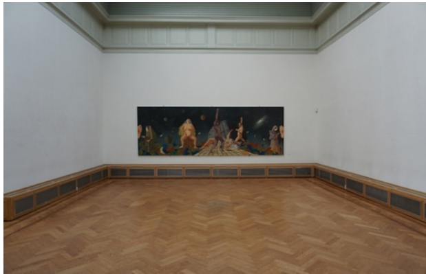
Umbilical Cord, 2018 Oil on canvas, 200x600