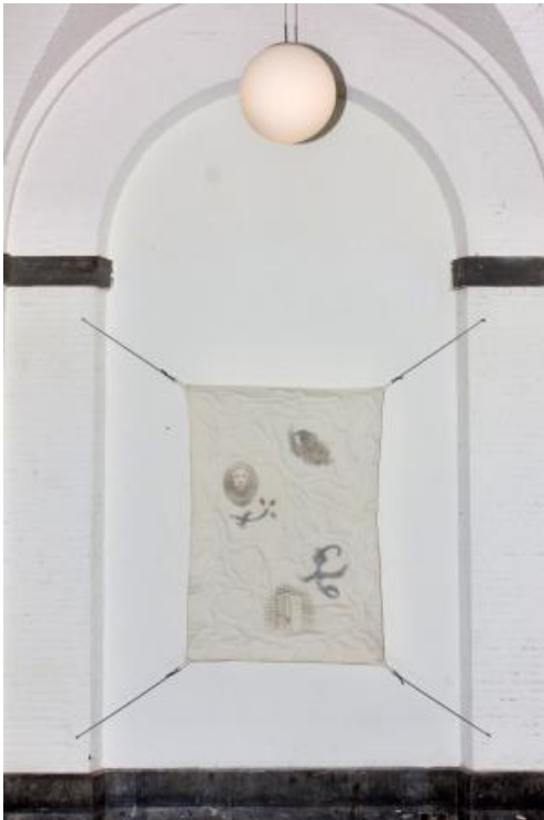
Ain't I a Woman?, 2023 Sewing, quilting and heat pressing, 120x200x10 cm