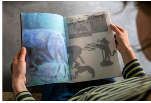
Wild Imaginations, 2025 Comcolor printed, Japanese bind by hand, 30x45x1,5 cm