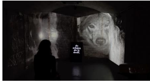
A Wild Encounter, 2025 Projection of video edit, 3D render and script., 500x300 cm