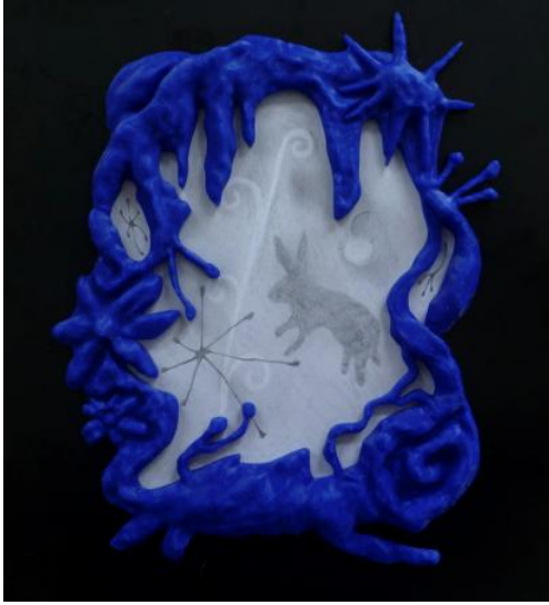
Nature Frame, 2024 PLA and graphite on paper, 30x20x3 cm