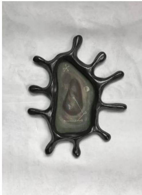
Portal, 2024 Ceramic with glaze. Pastel chalk on paper., 20x15x1 cm