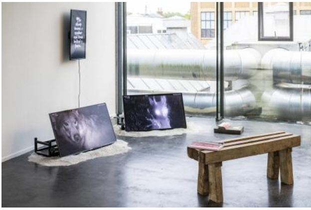
A Wild Encounter, 2025 Video editing, 3D rendering, 300x400x200 cm