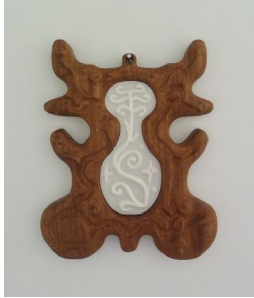
Sick Bug, 2024 Engraved wood with PLA., 50x40x10 cm