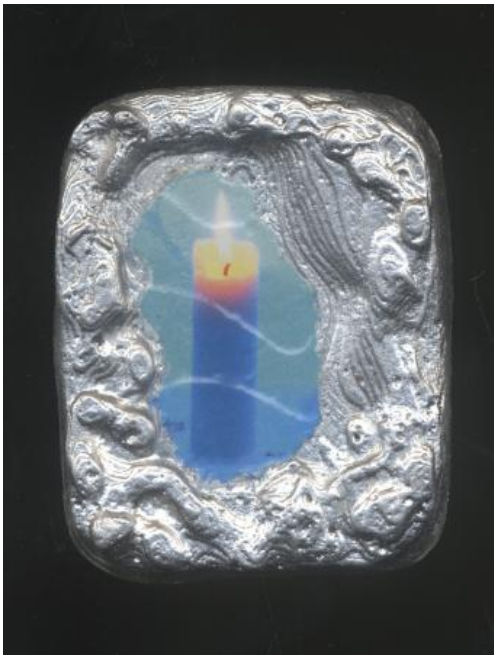
Metal Cast Frame, 2024 Metal casting + inkjet printer, 5x3x0.5 cm