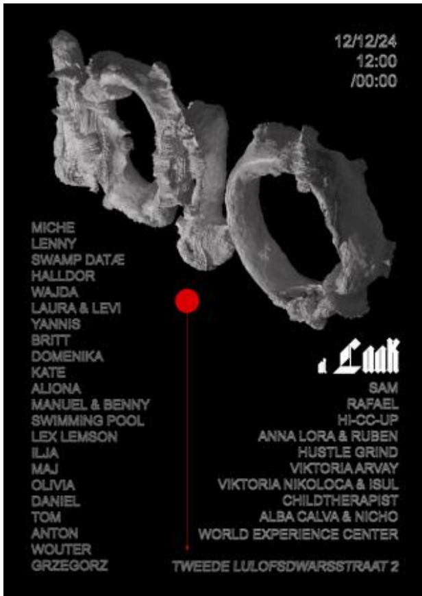
Poster 1010, 2025 digital mixed media, 1189 x 841