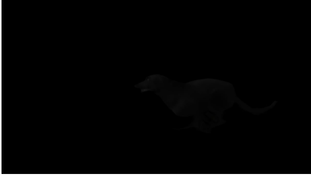
Lotus Eater, 2026 02:48