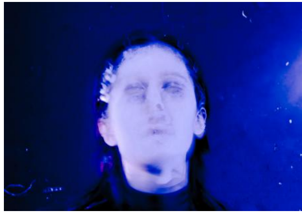
Morpheus, 2025 Photography and Photoshop