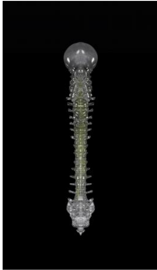
IO, 2023 digital 3D Sculpture, print on satin-gloss paper, 290 x 181