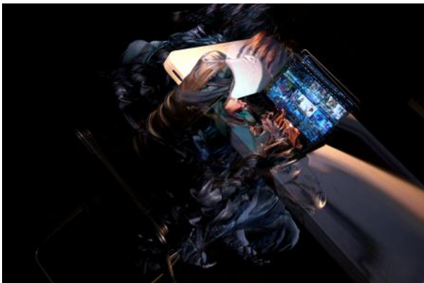
digital/physical, 2025 photography and photoshop