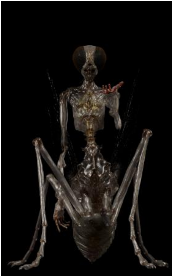
IO, 2025 3D Animation, projection on black canvas, 290 x 181