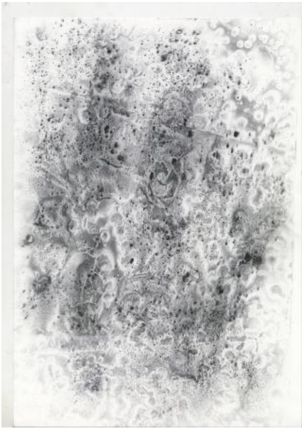
Static Transmutation, 2022 Toner powder on paper, 420mm x 297mm