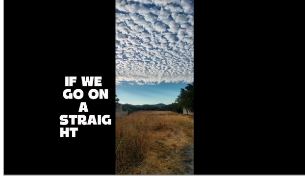
shortcuts, 2026 1:45