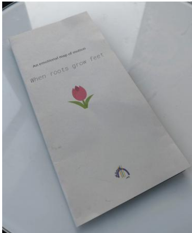
When Roots Grow Feet, 2026 inkjet print, custom