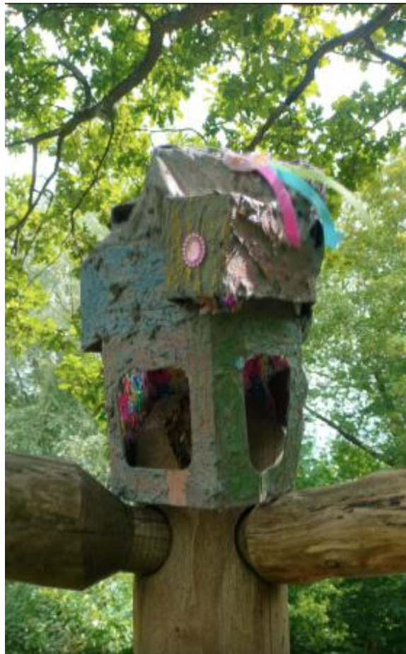
Complicated, 2025 Mixed media