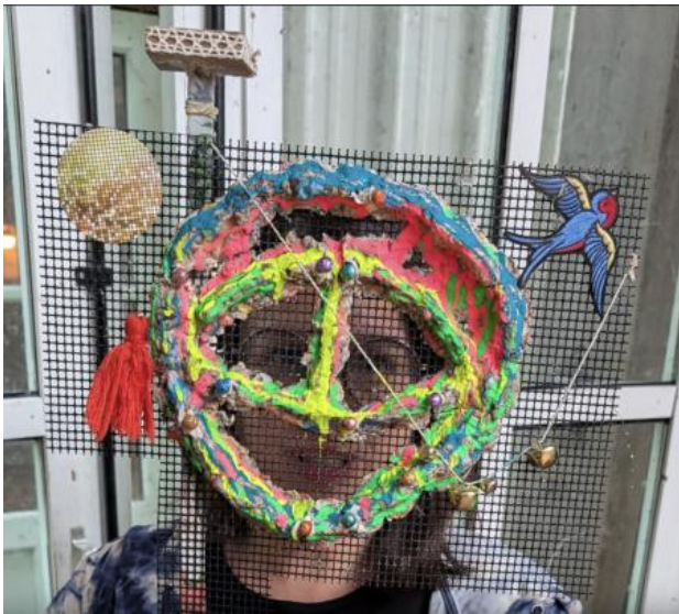
Naive, 2025 Mixed media