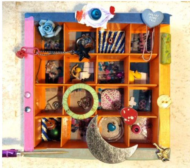
Shrine, 2026 mixed media, 15x15