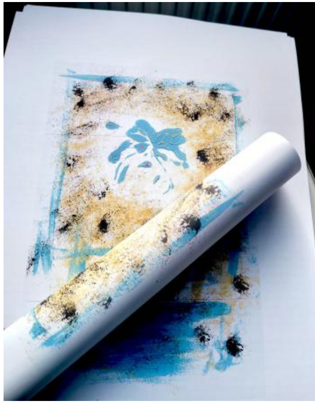
part(y)ings and meetings, 2026 inkjet print, A3