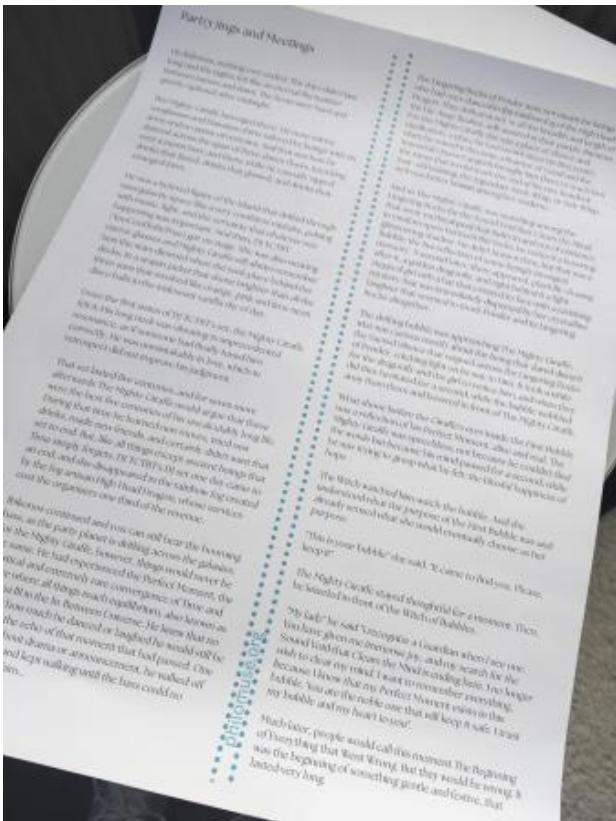
part(y)ings and meetings, 2026 inkjet print, A3