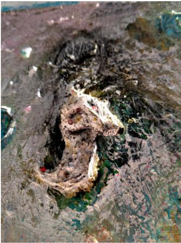
I will protect you, 2026 Acrylic on canvas, mixed media, 20x20