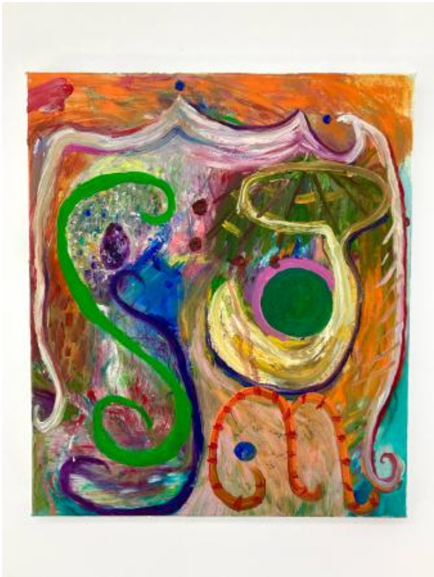
no title, 2025 oil on linen, 45 x 39 cm