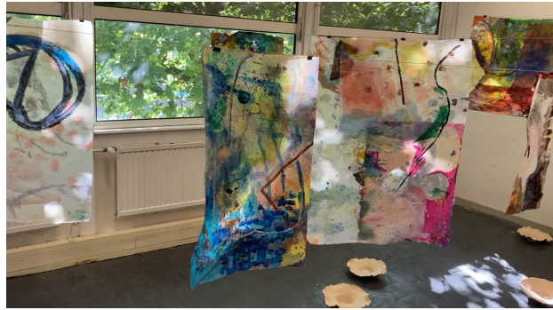
Open studio, 2024 0