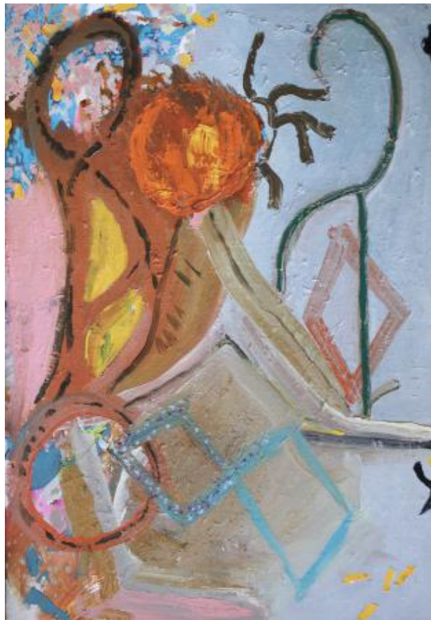
no title, 2023 oil on linen, 77 x 53 cm