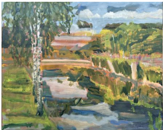
Den Haag's Texture, 2025 Oils, 50 x 40 cm

-- The Art People Gallery hong kong, Hong Kong https://www.theartpeoplegallery.com