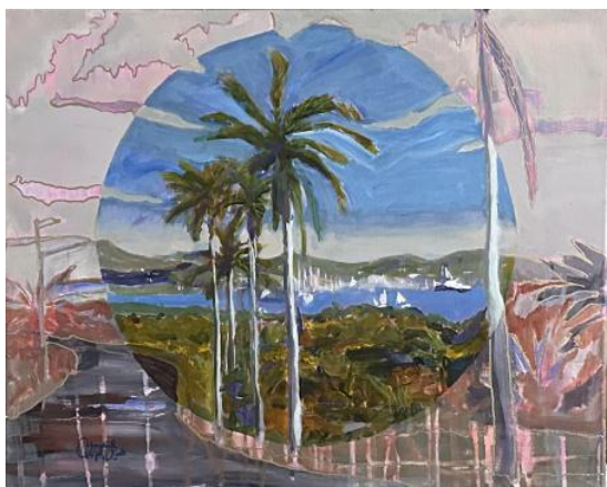
Driving Down to the beach, 2025 Acrylics, 50 x 40 cm