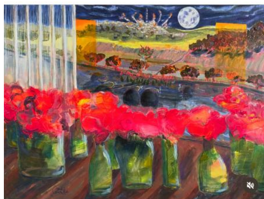
Dressed -REVAMPED, 2024 Acrylics and soft pastel, 100 x 75 cm