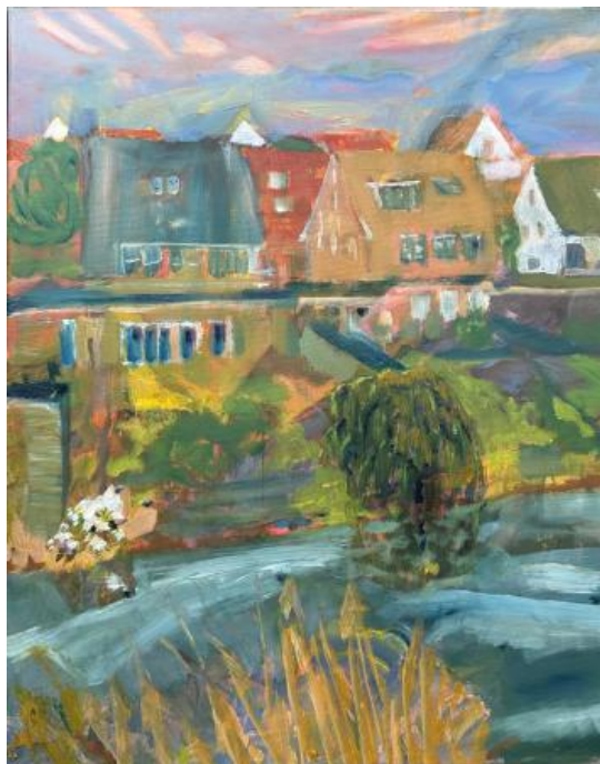
The view from across the canal, 2025 Oils, 40 X 50 cm