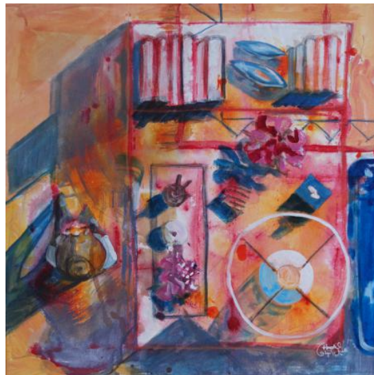
Fiddle, 2024 Acrylics and Crayon, 50 x 50cm