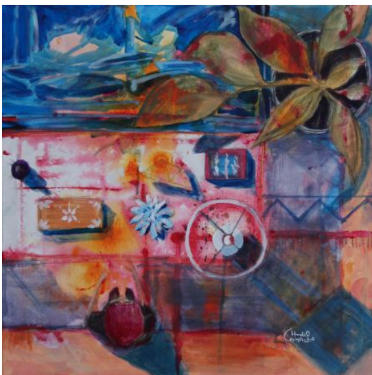
Fiddle, 2024 Acrylics and Crayon, 50 x 50cm