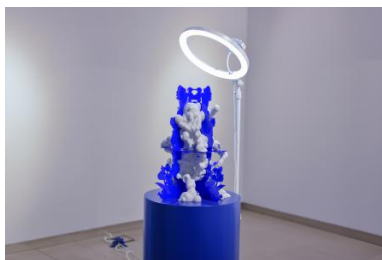
SPAM-Future Oracle, 2025 site-specific installation consisted of 3D-printed object, plexiglass cut-outs, led light ring and audio piece