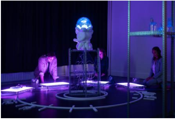
Doom Scroll Rehab: Cache Cleanse, 2025 3D Printed, CNC Cutting and engraving, ritualistic circle with approximate dimensions of 4,20 x 4,20 m