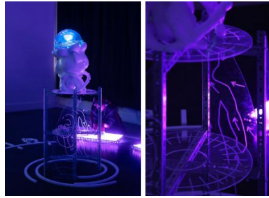
Doom Scroll Rehab: Cache Cleanse, 2025 3D Printed, CNC Cutting and engraving, approximate height of 1,70 m