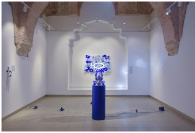
SPAM, 2025 site-specific installation consisted of 3D-printed object, plexiglass cut-outs, led light ring and audio piece