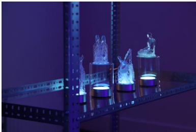
Doom Scroll Rehab: Cache Cleanse, 2025 Resin 3D-printed sculptures.