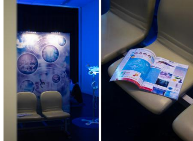
Doom Scroll Rehab: Cache Cleanse, 2025 Print on durable material