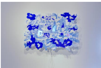
SPAM-In Defence of the abandoned billboard, 2025 Illustration printed on self-adhesive PVC foil / plexiglass cut-outs, 150x105cm