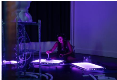
Doom Scroll Rehab: Cache Cleanse, 2025