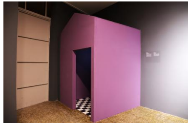
Honey, I'm Home, 2024 knauf blocks, pvc foil floor sticker, 1.5 x 1.5 x 2 m