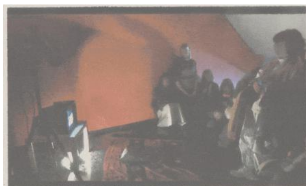
An Open Letter for Self-Acknowledgment, 2023 Installation and Performance