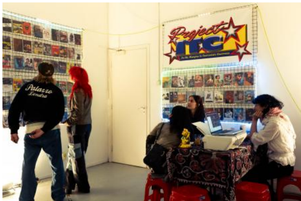
Project ITC, 2024 Installation and Participatory Work

leguesswho.com/lineup/project-itc?referrer=search Group