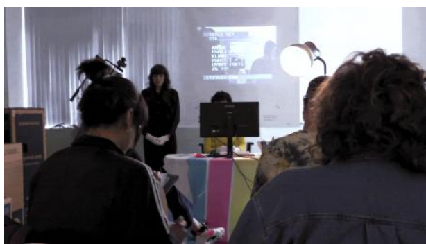
Ever-Changing.docx, 2023 Installation and Participatory Work