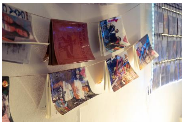
Project ITC, 2024 Installation and Participatory Work