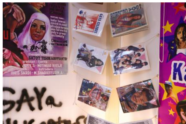
Project ITC, 2024 Installation and Participatory Work