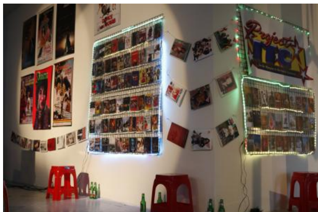
Project ITC, 2024 Installation and Participatory Work