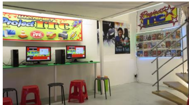
WARNET Project ITC, 2024 Installation and Participatory Work