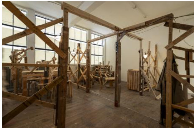
People Watching, 2024 Installation, Occupying a space of 7m x 7m