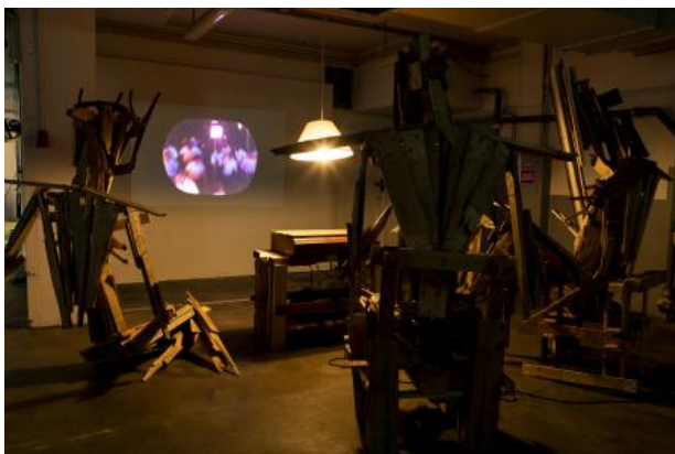
Getting Comfortable in Your Skinsuit , 2023 Additive wood sculpture, Occupying a space of roughly 3,5m x 3,5m with figures each round 2,2m tall