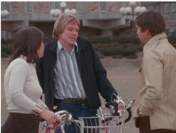
People Watching, 2024 16mins

exhibit our work and to step outside the walls of the art academy for the first time as a group from all different corners of the world.” “Our exhibition will showcase our diverse range of practices, from sculpture to painting, video, installation, printmaking, performance and other spectacles. Each of our artistic voices is unique, but we are proud to showcase our shared passion for creating.” Group