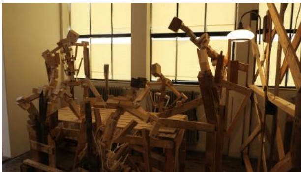
People Watching, 2024

People Watching, 2024 Installation, Each Puppet is 2,5m tall and 90cm from shoulder to shoulder