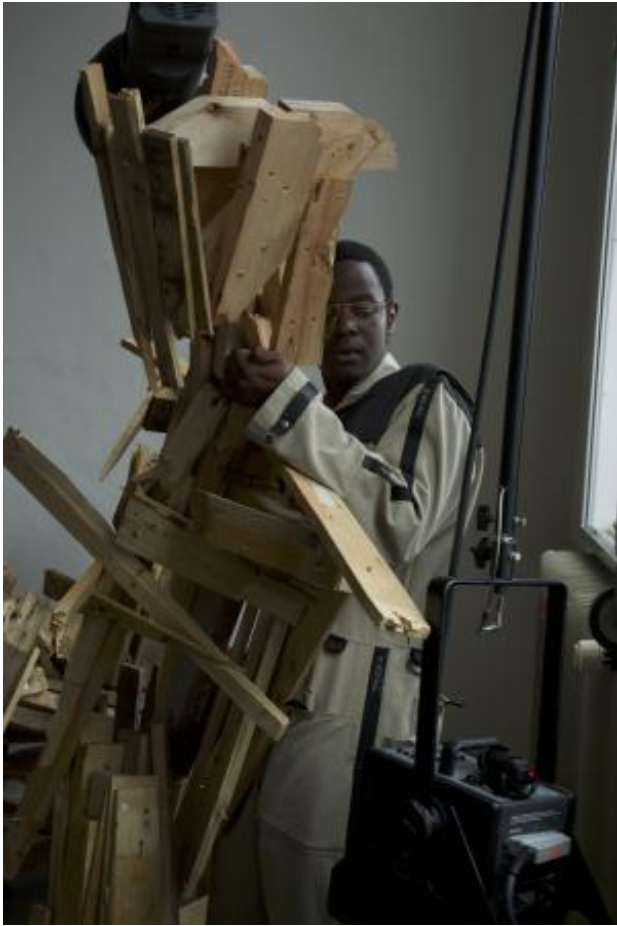
Getting Comfortable in your Skinsuit, 2023 Additive wood sculpture