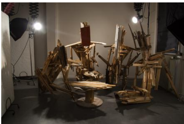
Getting Comfortable in your Skinsuit, 2023 Additive wood sculpture, Occupying a space of roughly 3,5m x 3,5m with figures each round 2,2m tall