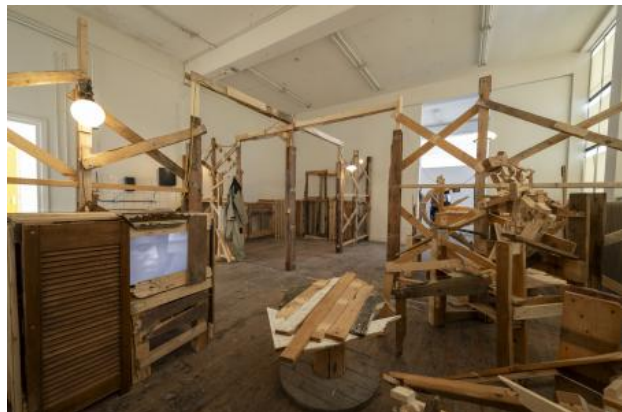
People Watching, 2024 Installation, Occupying a space of 7m x 7m