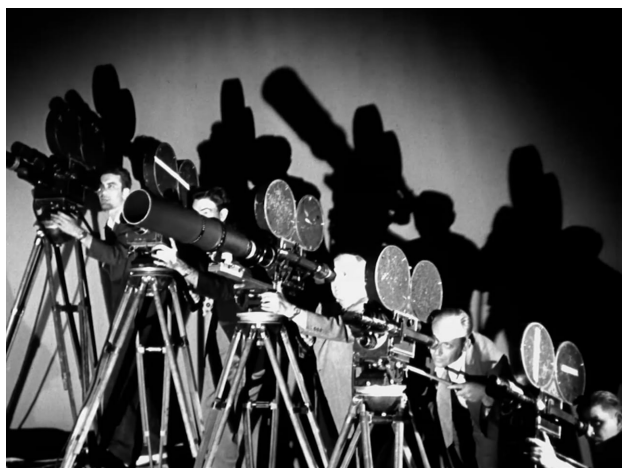
Getting Comfortable in your Skinsuit, 2023 30mins