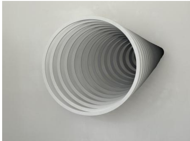
Horn of Plenty, 2024 CNC-cut circles, paint, 150cm x 110cm