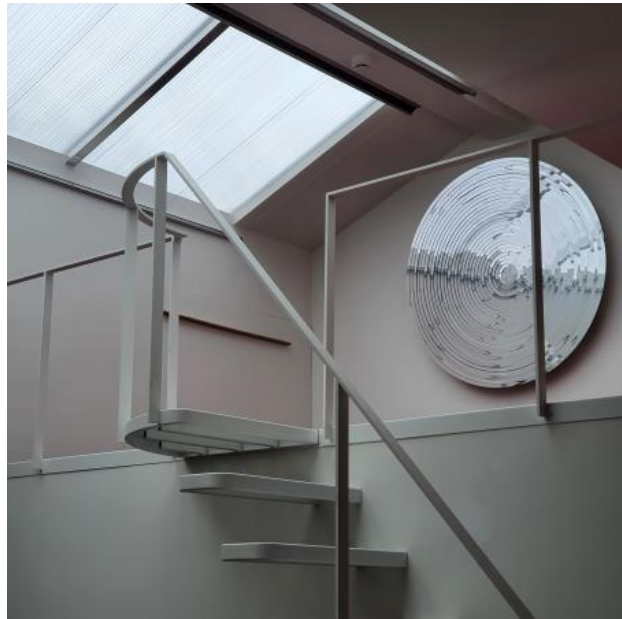
Concentric mirror, 2025 CNC-cut Polished aluminium, wood, 120 x 20