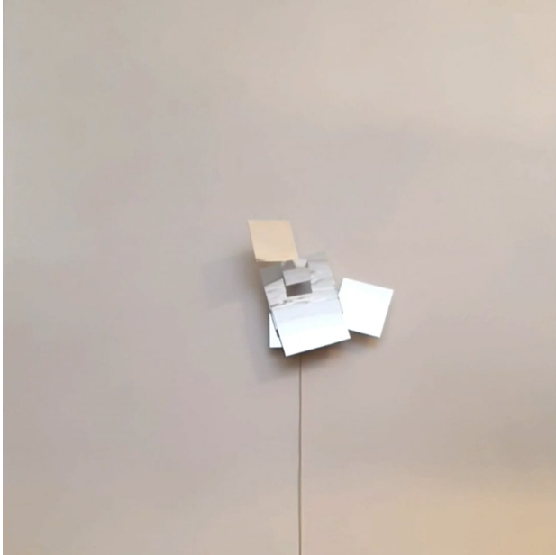
Scattered fragments of my room., 2025 17 sec