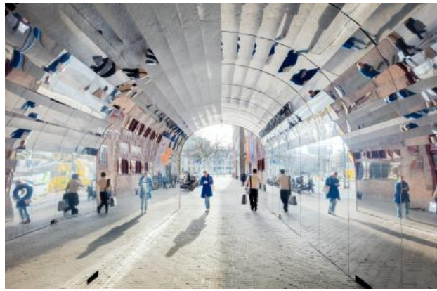
Mirror tunnel, 2025 Wood construction, aluminium mirrors, 8m x 4m x 4m