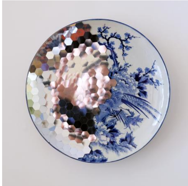
Arita plate mirror, 2025 19th century Arita plate, polished aluminium, 55 x 55 x 6