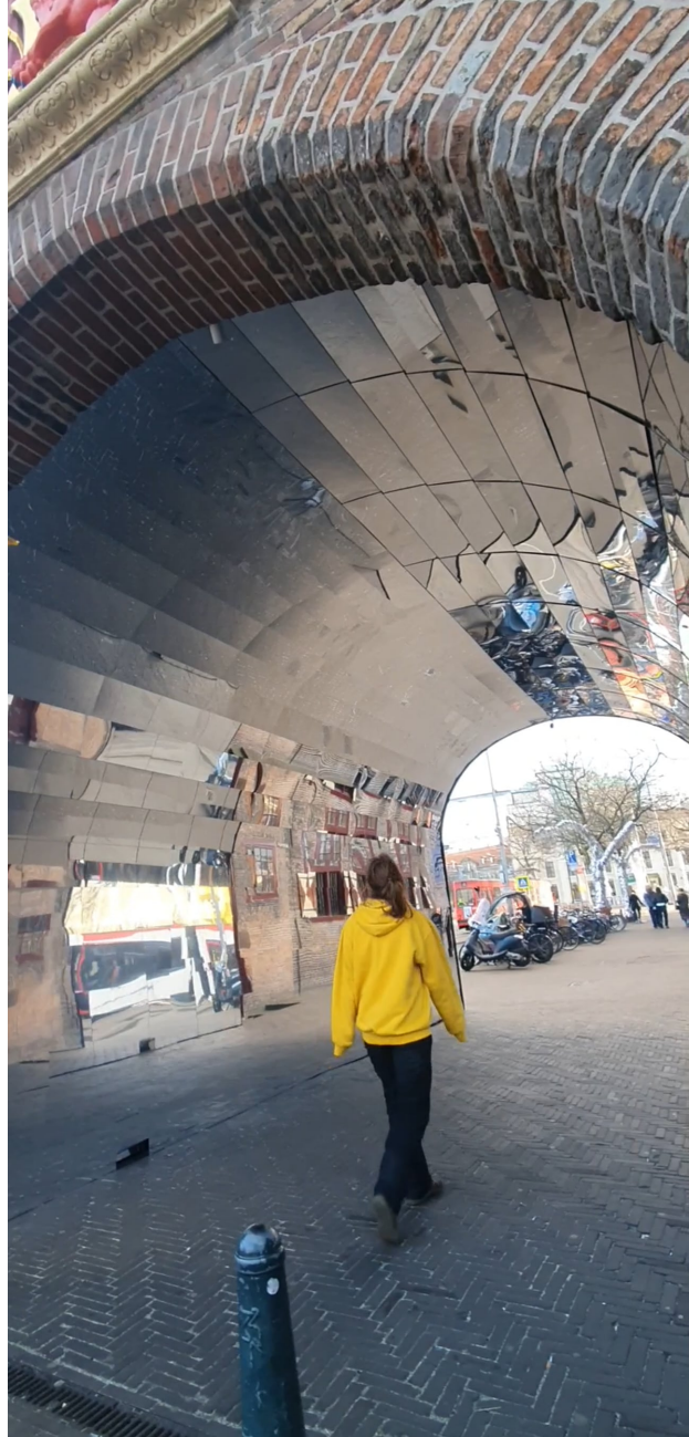
Mirror tunnel, 2025 22 sec