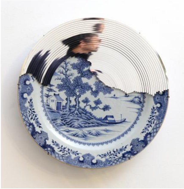
QianLong mirror plate 01, 2025 18th century Qianlong plate, polished aluminium, 42 x 42 x 4