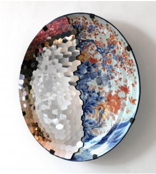
Three friends of winter, 2025 Antique Japanese charger, CNC -cut aluminium hexagons, 62 x 62 x 6