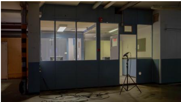
Besides,, 2024 installation, -