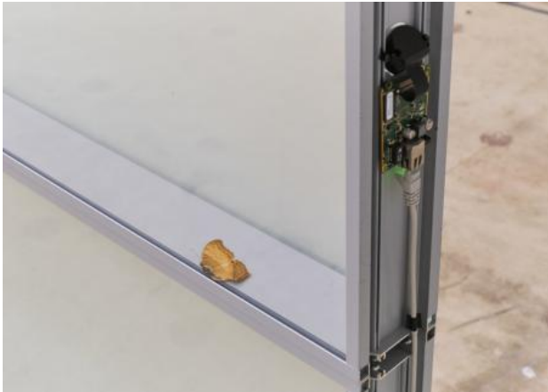
It folds until it breaks, it mirrors until it is whole, 2025 halve vlinder, glaspanelen, camera, LCD scherm, 180 x 180 cm