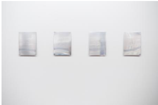
flies from the third floor, 2024 etchings, 20x85 cm