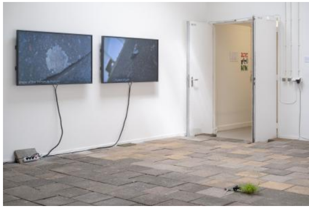
A piece of gum in the shape of a —, 2024 installation, -