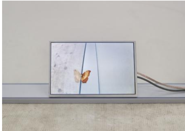
It folds until it breaks, it mirrors until it is whole, 2025 halve vlinder, glaspanelen, camera, LCD scherm, 180 x 180 cm