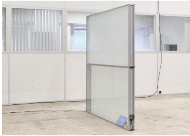
It folds until it breaks, it mirrors until it is whole, 2025