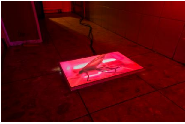
Tiny Death, 2026