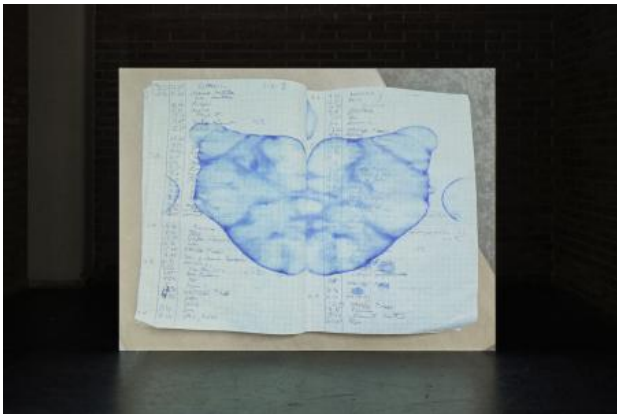
Plunge, 2025 één-kanaals video, 0:01, looped