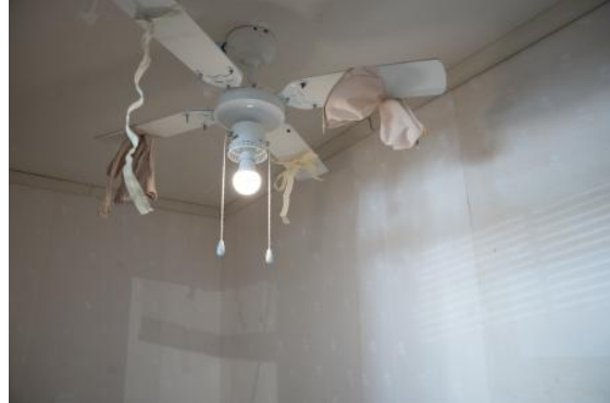
One-bedroom apartment, 2026 Installation, 3 square meters