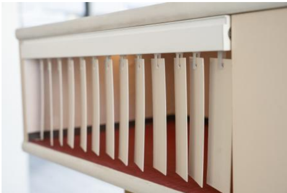
Dreamestate, 2026 Chipwood TV stand, textile, vertical blinds, paper, door viewer, LED lighting