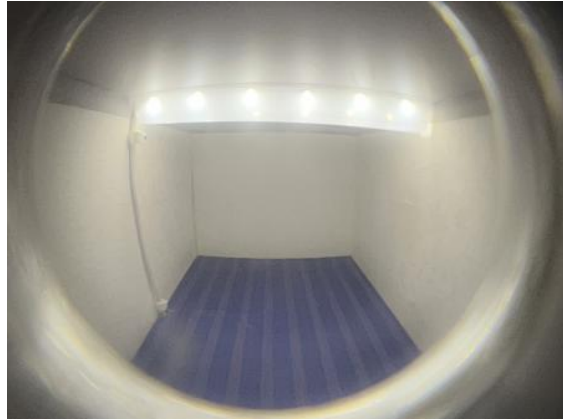
Dreamestate, 2026 Chipwood TV stand, textile, vertical blinds, paper, door viewer, LED lighting