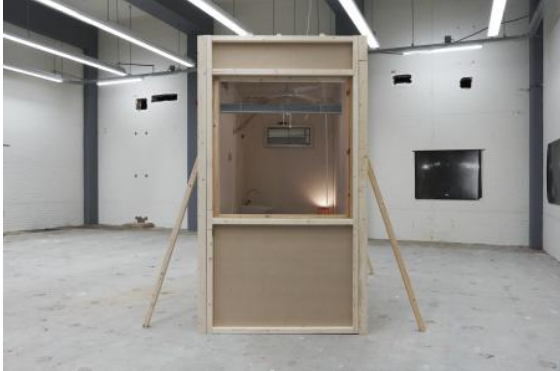
One-bedroom apartment, 2026 Installation, 3 square meters

2023 Grant for artistic work Oulu Educational Foundation Oulu, Finland Grant for artistic work