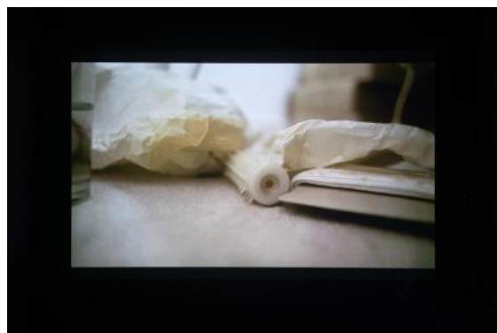
Cross-circulating, 2026 Video, 12:30 min