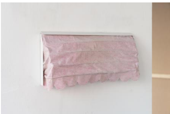
Dreamestate, 2026 Plastic, textile, vliesofliex