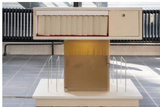
Dreamestate, 2026 Chipwood TV stand, textile, vertical blinds, paper, door viewer, LED lighting