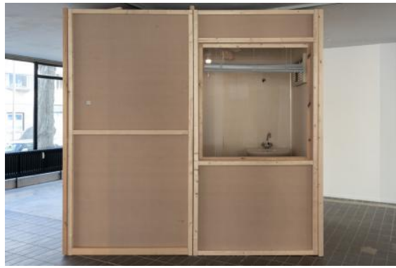
One-bedroom apartment, 2026 Installation, 3 square meters