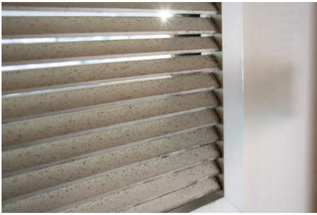
One-bedroom apartment, 2026 Installation, 3 square meters