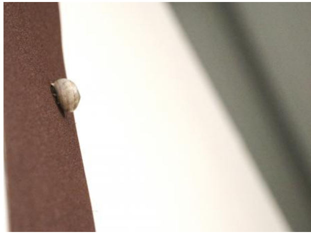
1h (detail), 2025