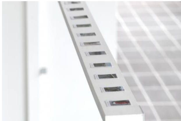
Cinderella stamps, 2025 80 customised illegal Post NL stamps