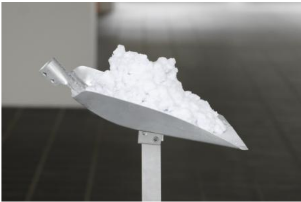
Old index, 2025 demolished archive paper dust, steel cleaning pan