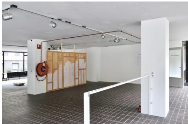
exhibition view Paper Walls, 2025