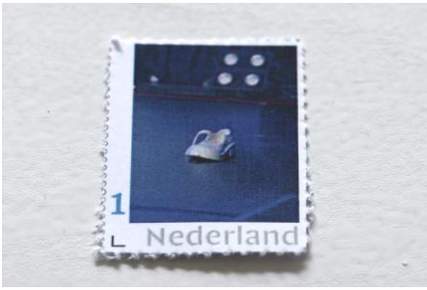
Cinderella Stamps, 2025 80 customised stamps