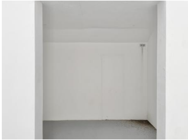
a Spit out! - A Leak!, 2025 intervention, variable