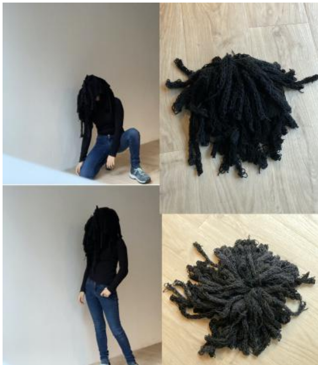
Untitled, 2025 Yarn and fabric, 40x30x30 cm

2023 Den Haag, Netherlands a3333280.myportfolio.com/practice Now, let us consider whether we, the human race, have made the right steps? There is no answer, so it is pointless to think about it, but we can be pessimistic about the current situation. It is thought that the world has become such a friendly place that we can live without being able to adapt because of the development of society, but is it really a good thing to continue to live without being able to adapt? It is neither good nor bad. The only difference may be that the suffering has become a little more complicated. Well, there is no point in thinking like this.