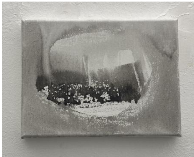
Farewell somewhere, 2024 Acryl on canvas, 18x20