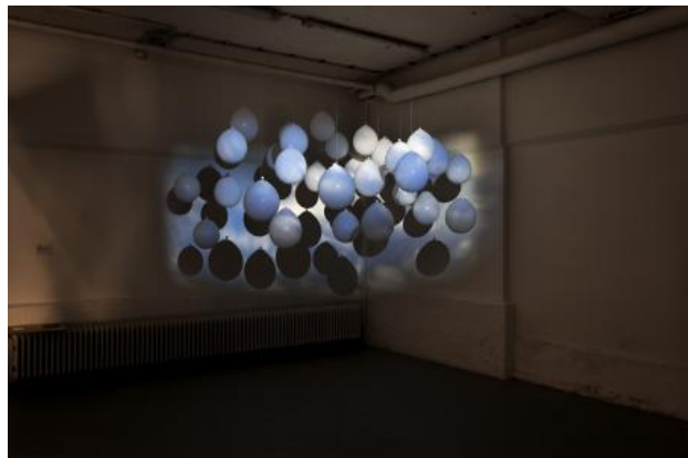
Balloon state, 2024 Latex balloon and projector