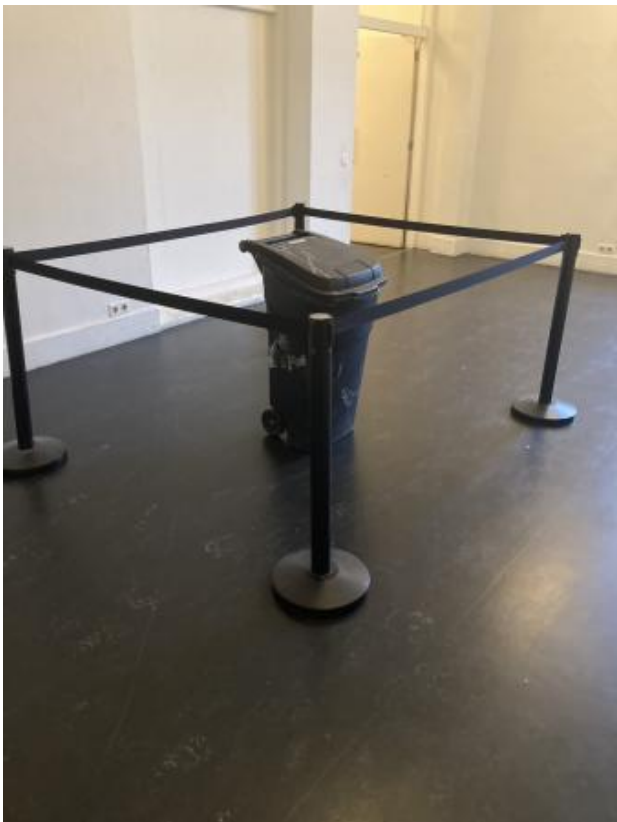
Pole partition, 2024