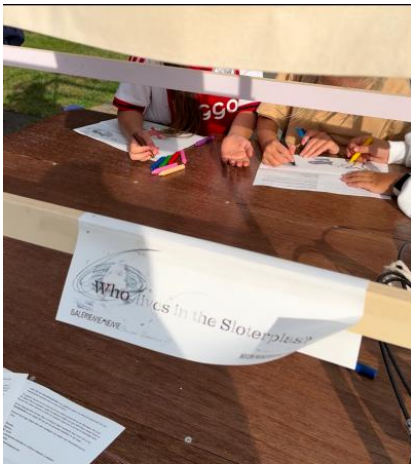
Who Lives in the Slotterplas?, 2025 Workshop