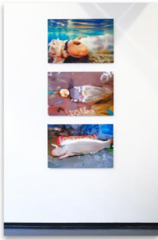
Fish Don't Exist, 2025 Machine learning, Photography, Inkjet prints , 50cm x 75cm x 3