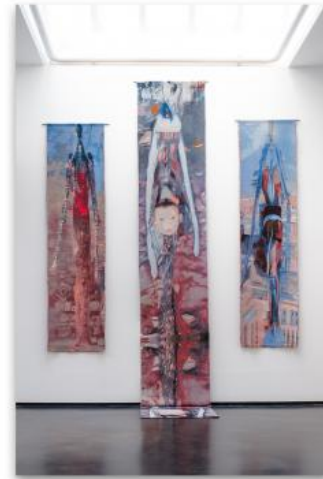
Diffusion, 2025 Machine learning, Jacquard Weaving, 75cm x 245cm; 80cm x 300cm; 75cm x 245cm