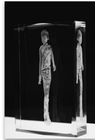
New Youth, 2025 Machine learning, Photography, 3D laser engravings in crystal, 12*4*18cm