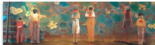
Diffusion, 2025 Machine learning, Photography, Digital painting