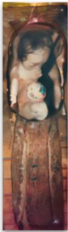
Diffusion, 2025 Machine learning, Photography, Digital painting