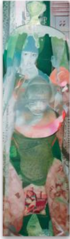
Diffusion, 2025 Machine learning, Photography, Digital painting