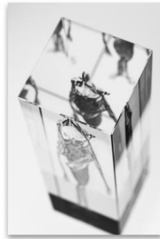
Diffusion, 2025 Machine learning, Photography, 3D laser engravings in crystal, 20*6*6cm