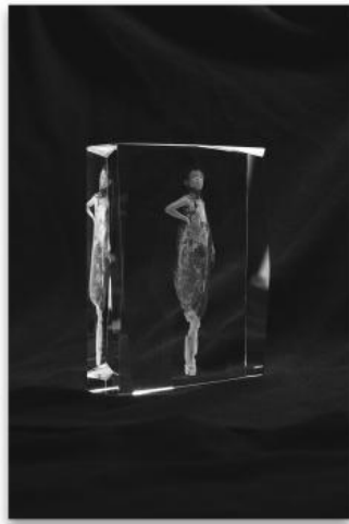
New Youth, 2025 Machine learning, Photography, 3D laser engravings in crystal, 12*4*18cm