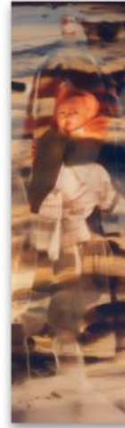
Diffusion, 2025 Machine learning, Photography, Digital painting