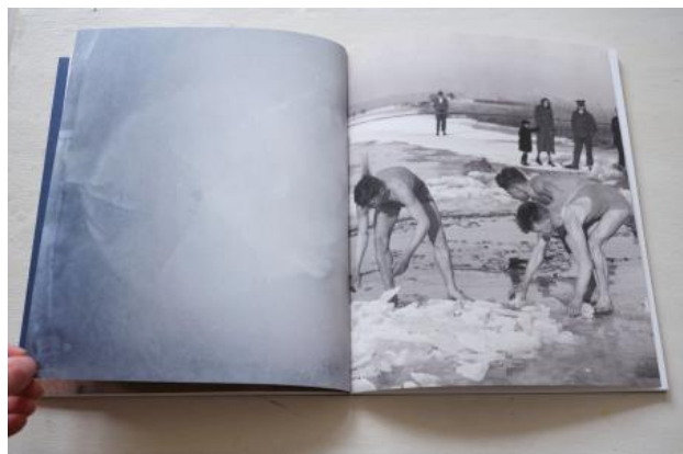
Warmth of the cold - Publication, 2023 Open swiss binding, 25 x 20