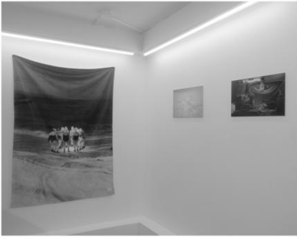
Exhibition view, Litla Gallery, 2024 sublimation printing method, digital photographs printed on munken paper and mounted.

as well as the dangers and risks that come with being in the sea.