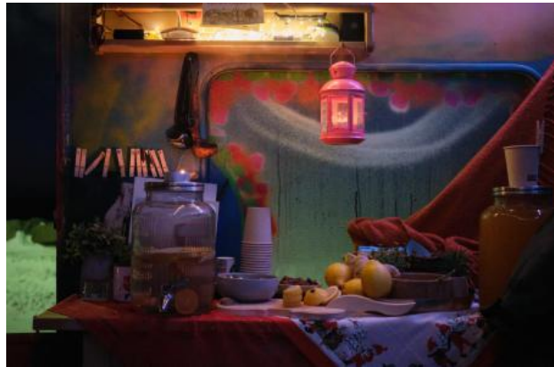
Moving Sauna, 2024 Digital Photograph, 42cm x 29cm