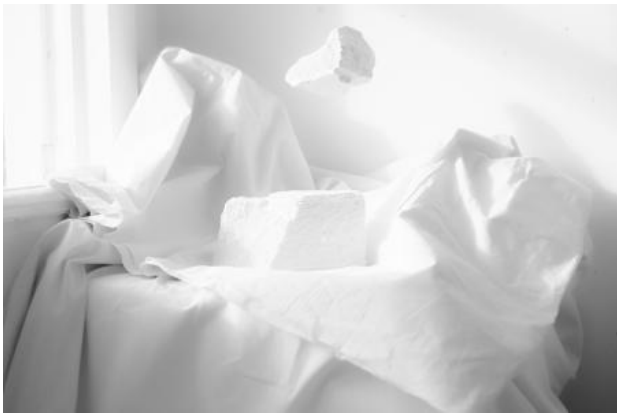
Sometimes up, sometimes down , 2022 Printed on glossy paper, in self made wood frame, 127cm x 88cm x 5cm