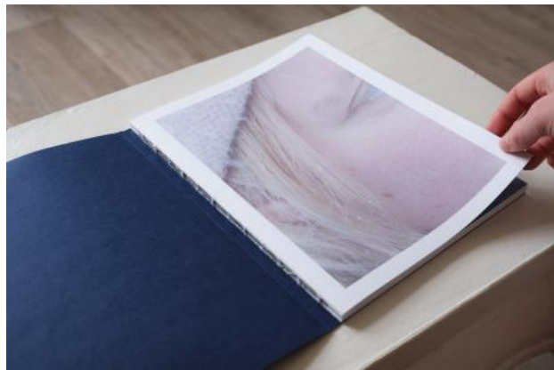
Warmth of the cold - Publication, 2023 Open swiss binding with Silk Screen printed cover , 25 x 20