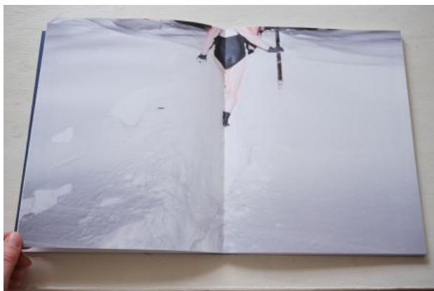
Warmth of the cold - Publication, 2023 Open swiss binding, 25 x 20