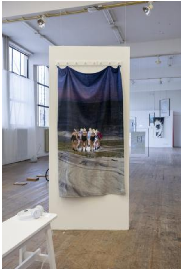
Warmth of the cold - Towel, 2023 Sublimation printing method., 140 x 90