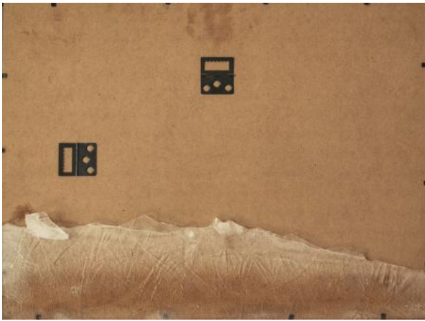
How to frame the cold?, 2023 digital photograph printed on munken paper and mounted., 42cm x 29cm