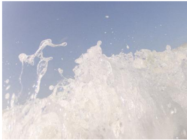
'Sjórin segir aaaa', 2023 Go Pro underwater camera attached to a head., 21 x 14,8