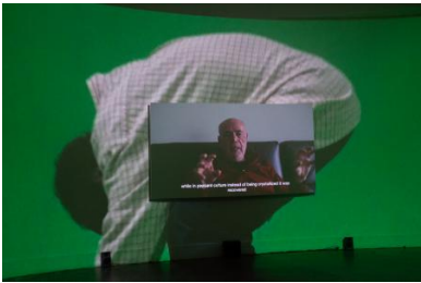
I love my land, 2024