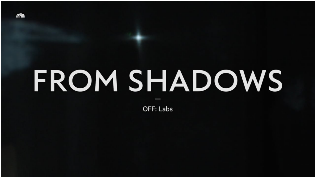
From Shadows, 2024

2022 - 2023 Simposio: realy utopia 2020 - 2024 Maul! Il Castello Contemporaneo 2020 - -- The Open Source School On-going