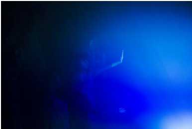
I hate indifference, 2024