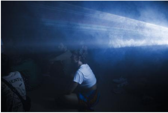
I hate indifference, 2024