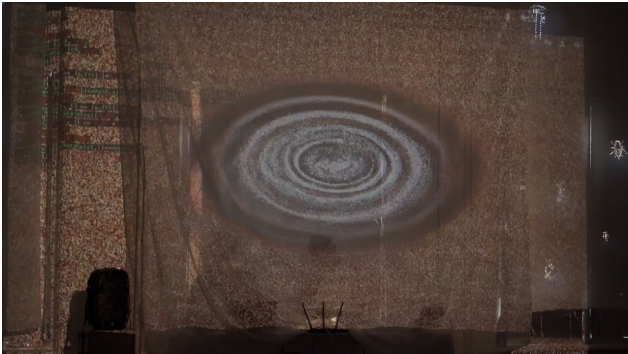
For Real not for Art, 2024