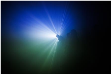
I hate indifference, 2024