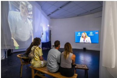
I love my land, 2024