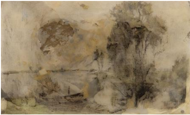
Land-letting (3), 2025 Fish glue cast painting, 48 x 63