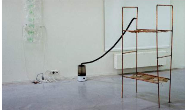
Liquidity, 2025 Humidified copper shelving unit with fish glue, inflating food packaging, Dimensions variable