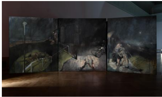
Standfast, landfast, lightfast, 2025 Oil on canvas, 200 x 535