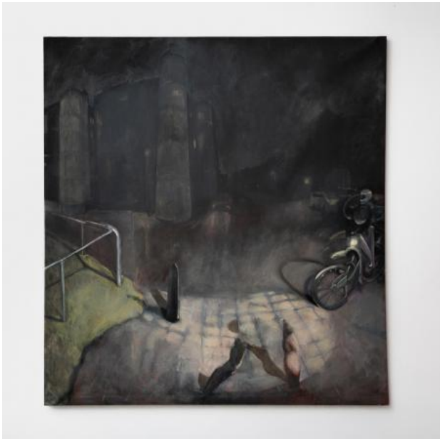
Standfast, landfast, lightfast (2), 2025 Oil on canvas, 200 x 185