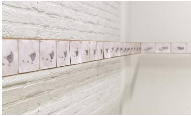
Sublimate, 2025 86 A6 pencil drawings, 11 x 1333