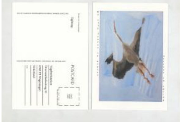
Passage Bird Postcard Project, 2026 Postcard , 9 x 14