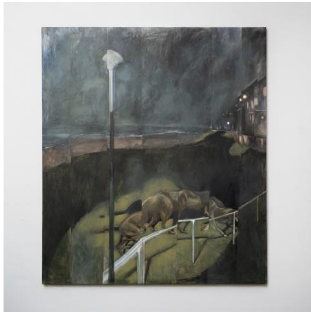
Standfast, landfast, lightfast (1), 2025 Oil on canvas, 200 x 175