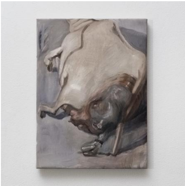
A rectangle separating want from must, 2025 Oil on canvas, 43 x 34