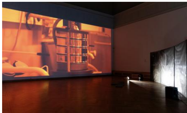
Standfast, landfast, lightfast, 2025 Video and painting installation, 200 x 535