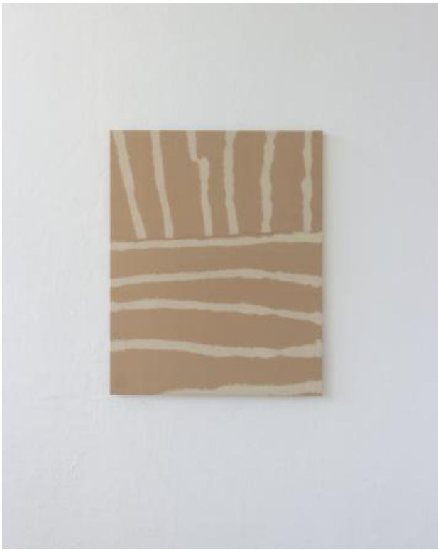
off the grid, 2022 bleach on sewn fabrics, 100x80cm