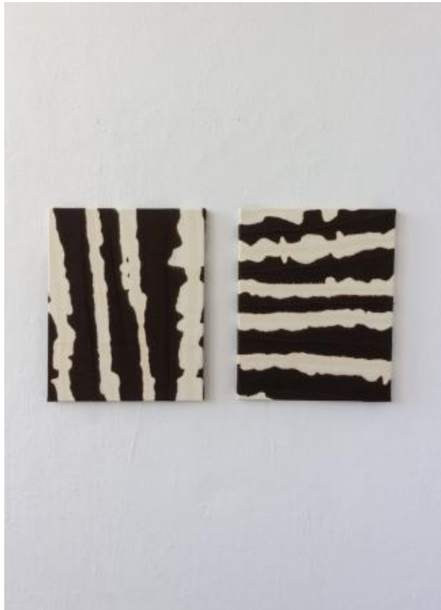
point and shoot, 2022 bleach on sewn fabrics, 2x50x40cm