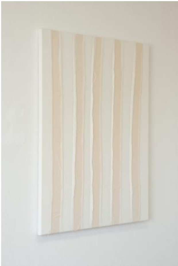
untitled, 2023 sewn fabrics, 80x60cm