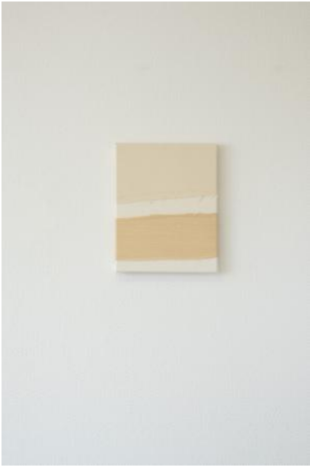
untitled, 2023 sewn fabrics, 30x25cm