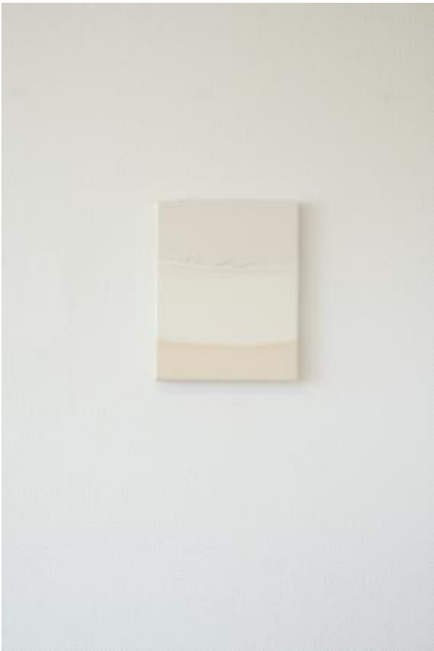
untitled, 2022 sewn fabrics, 30x25cm