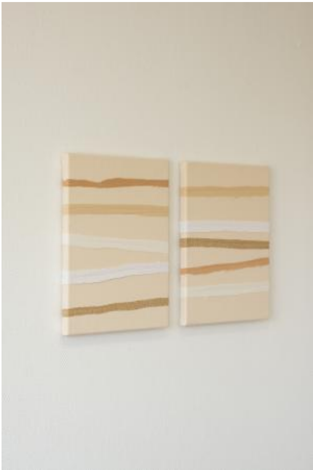
untitled, 2024 sewn fabrics, 2x40x30cm