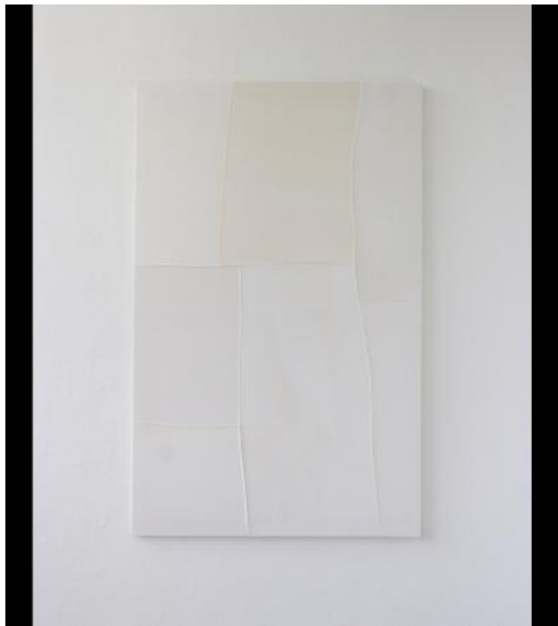
shadows make shadows, 2022 sewn fabrics, 185x120cm