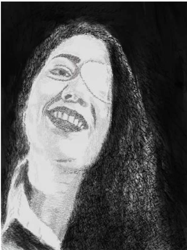
May the Heart That Fears Die, 2025 Digital drawing, text-based portrait

2018 G-20 Seattle Central College's Art Fair Seattle, Vereniged Staten