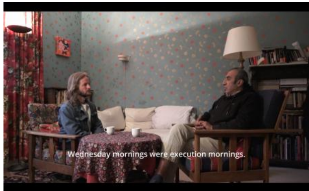
Wednesdays: Prison Series, 2023 Video Installation