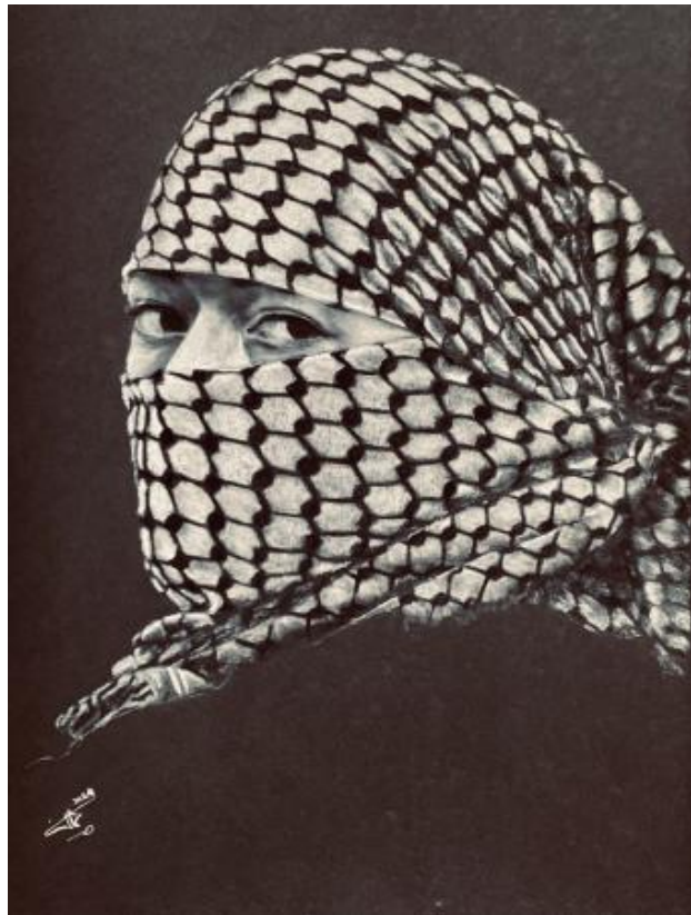
Keffyeh, 2024 White coal on black paper, 40 * 60