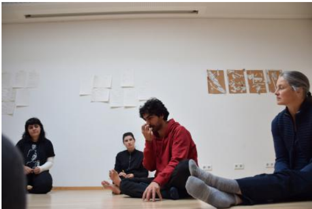
Happening to One Another, 2023