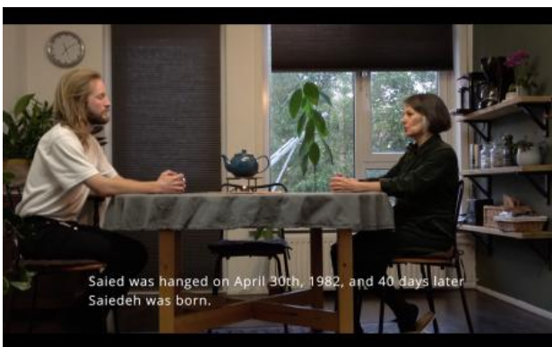
Namesake: Prison Series, 2023 Video Installation