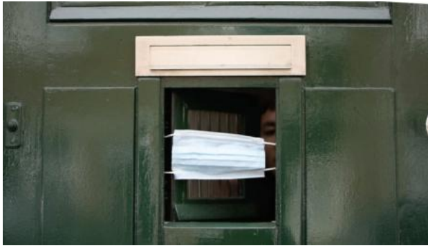
Mask, 2021 Video instalation.