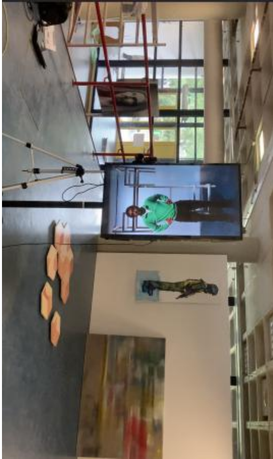
My Throne, 2021 Found object construction and inverted videography., 2m * 1.6m * 0.4m