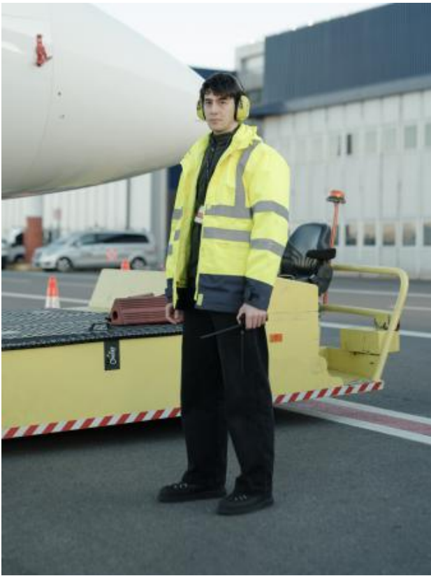
Imagining myself in your position, 2024