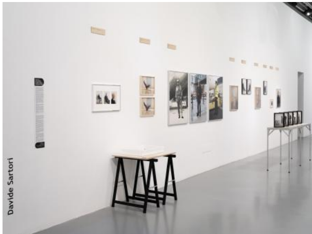
The shape of our eyes, other things I wouldn't know, 2025 Art insallation