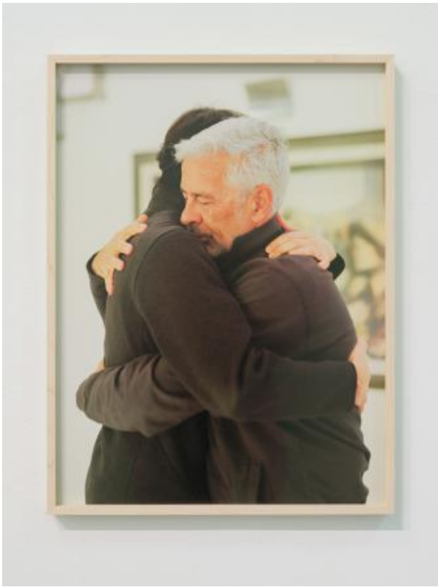
Embracing eachother, 2025