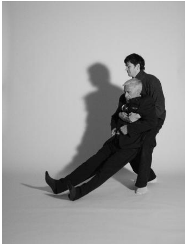
Building trust, 2024