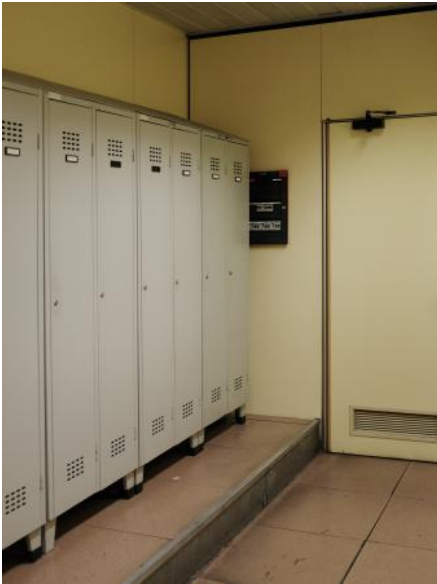
The place where you spend most of your time, 2024