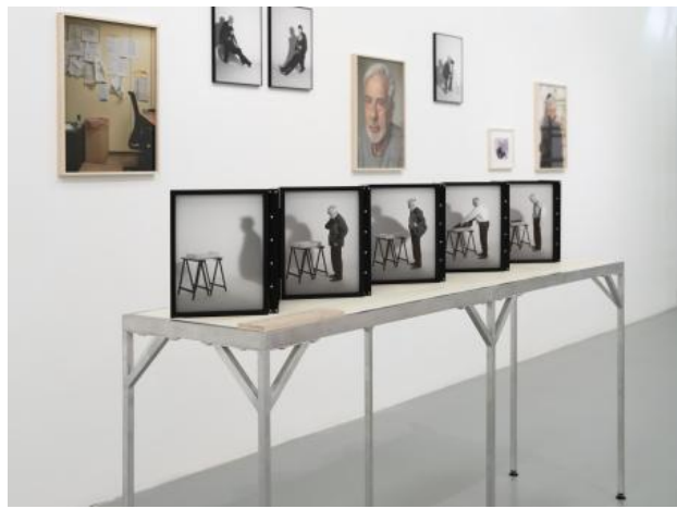
Wearing your uniform, 2025