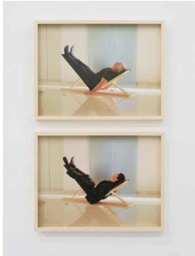
Mimicking the positions you take, 2025