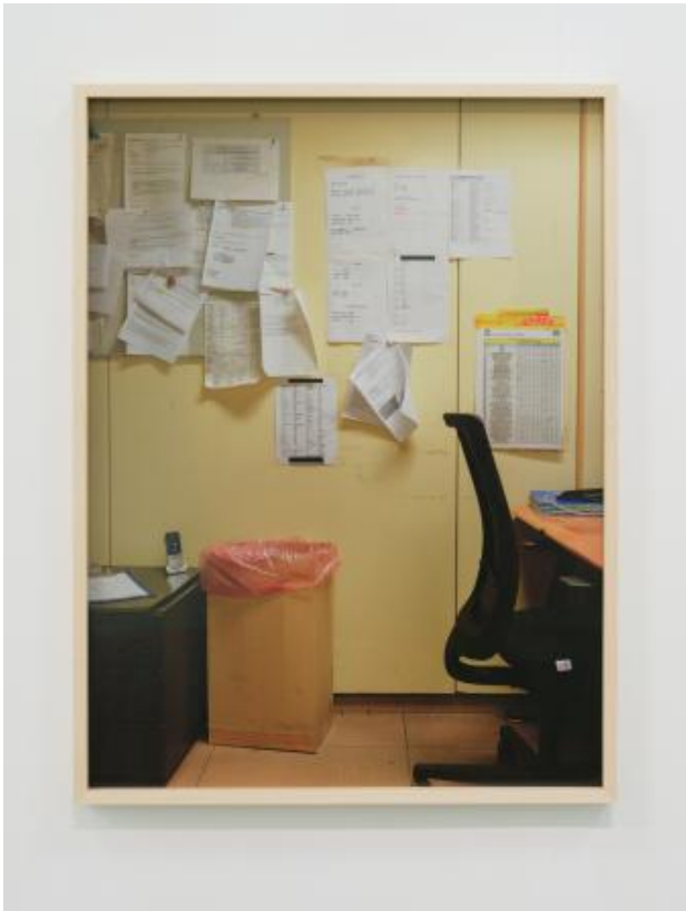
Looking at the place where most of your time is spent, 2025