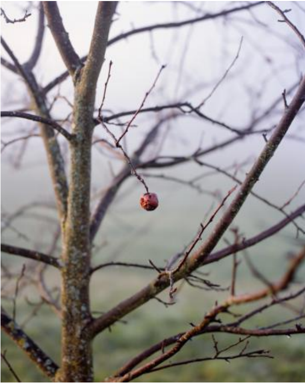
In the mountains, the sun is shining, 2024 Handwritten captions