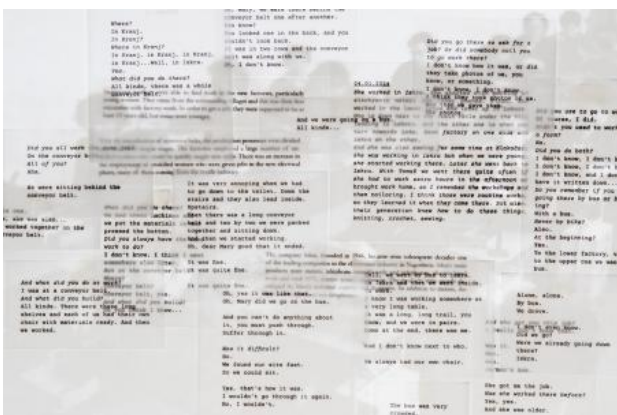
In the mountains, the sun is shining, 2024 Collage