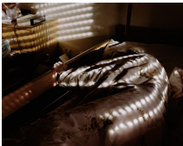
In the mountains, the sun is shining, 2024 Photography