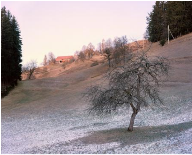
In the mountains, the sun is shining, 2024 Photography