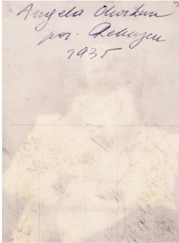
In the mountains, the sun is shining, 2024 Rephotographed archival image