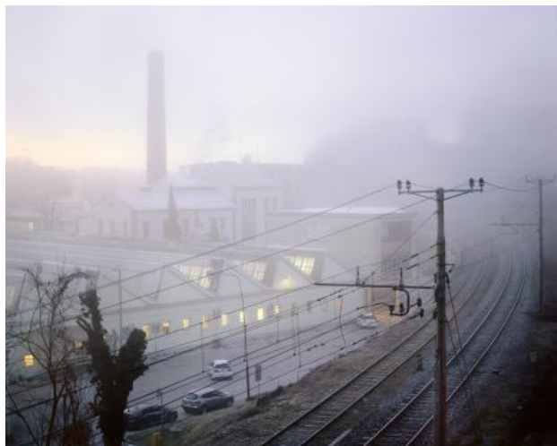
In the mountains, the sun is shining, 2024 Photography