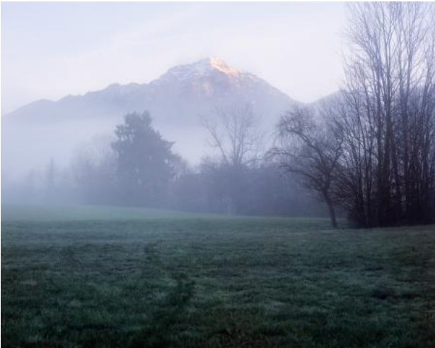
In the mountains, the sun is shining, 2024 Photography

2022 Fotofabbrica Prize Gonzaga, Italy Shortlist