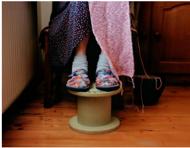
In the mountains, the sun is shining, 2024 Photography