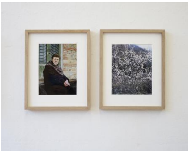
Her Forest, Tearless as Stone, 2024 Photography, C-print, 40x50 cm