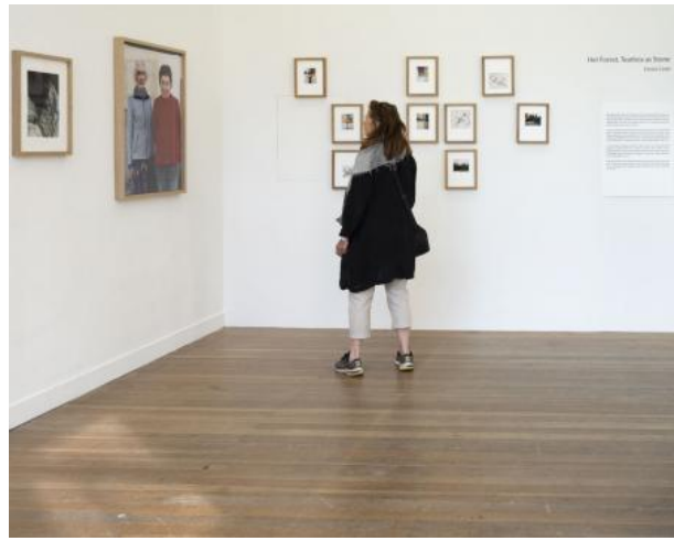
Her Forest, Tearless as Stone, 2024 Photography, C-print