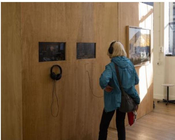
Her Forest, Tearless as Stone, 2024 Video