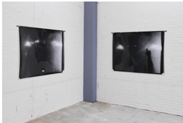
The coldest day of the year, 2026 Silver gelatin print , 106x140 cm