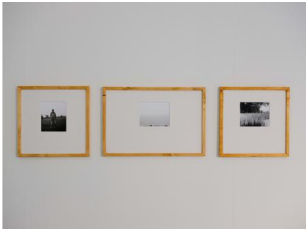
Mountain Never Meet but People Do, 2023 Photography, 40x40 - 40x60 cm