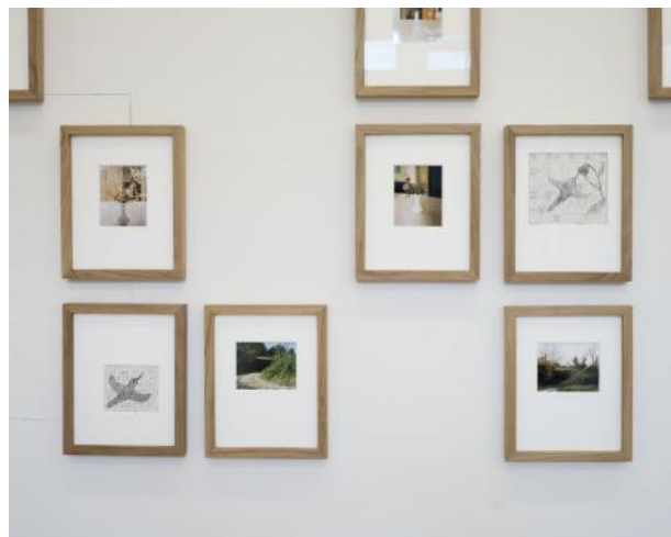
Her Forest, Tearless as Stone, 2024 Photography, C-print, 28x22 cm