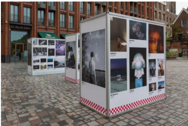
Regenerate , 2023 Photography