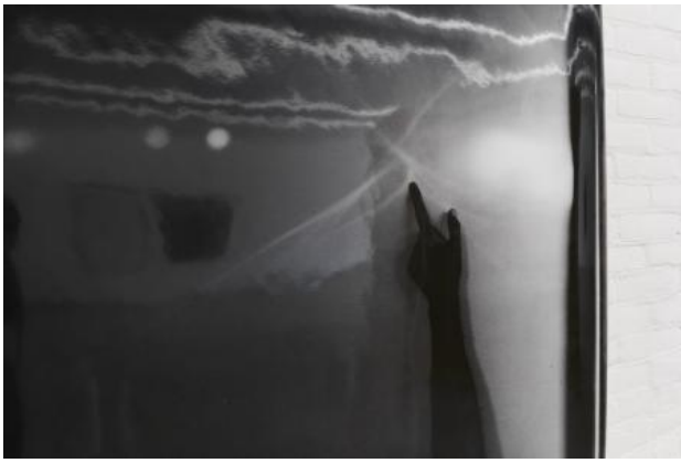
The coldest day of the year, 2026 Silver gelatin print , 106x140 cm