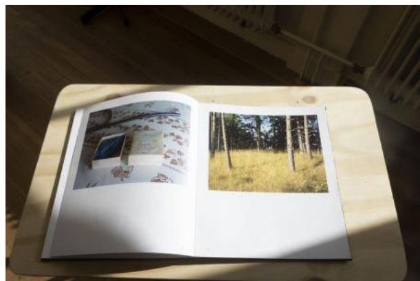
Her Forest, Tearless as Stone, 2024 Photobook