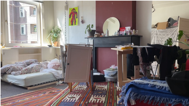
Domestic Daydreams_A Thing for In-Between-Clothes, 2024 03:06