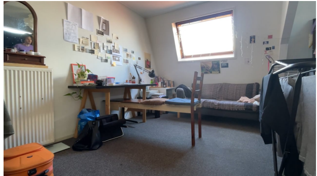
Domestic Daydreams_Long Chair, 2024 03:50