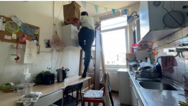
Domestic Daydreams, 2024