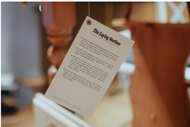
Domestic Daydreams, 2024