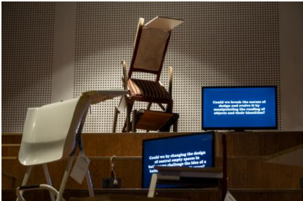
Domestic Daydreams, 2024