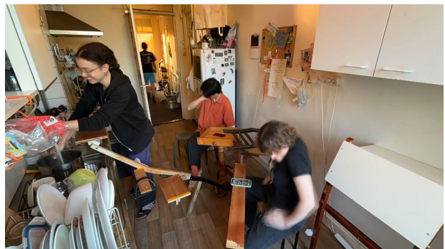
Domestic Daydreams_Branched table, 2024 03:40