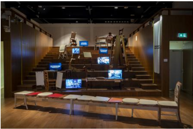
Domestic Daydreams, 2024