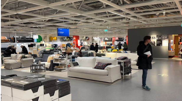
Domestic Daydreams_Context, 2024 03:00