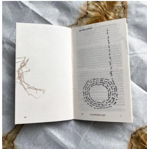
The first impression on your skin, 2024