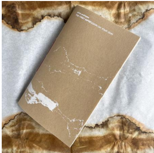
The first impression on your skin, 2024