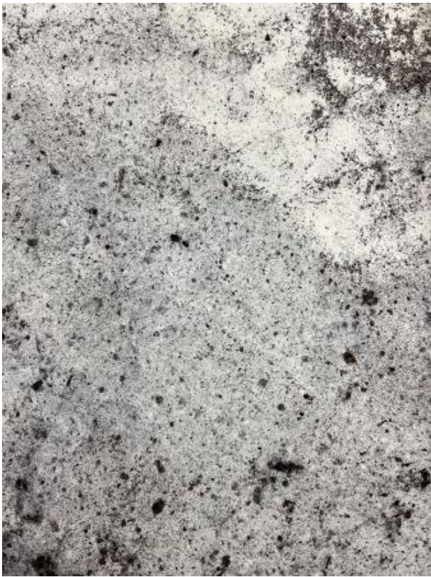
Soil, 2024 handmade paper, soil, 40x40 cm