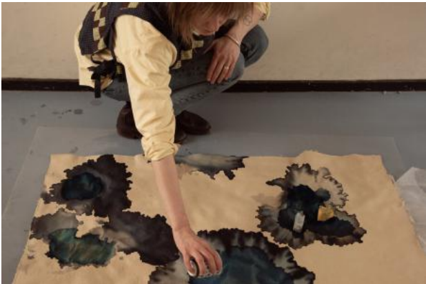
Be Like Water, 2024 Corn leaf paper, cyanotype, performance, 130x130 cm