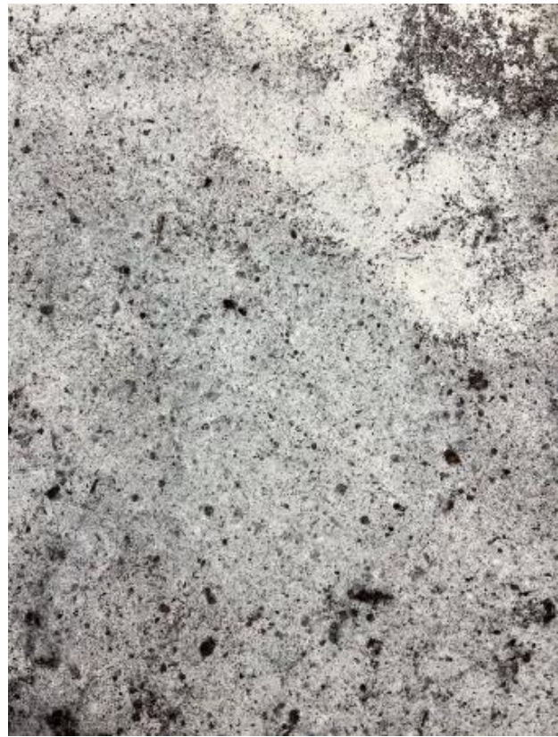
Soil, 2024 handmade paper, soil, 40x40 cm