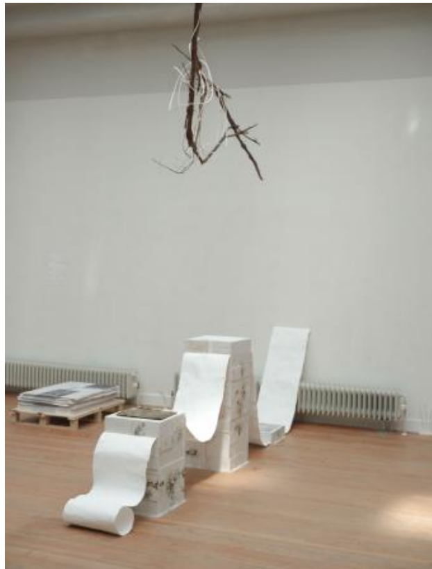
THE CLOUD IS A PLACE ON EARTH, 2024 Installation, participatory performance, publication