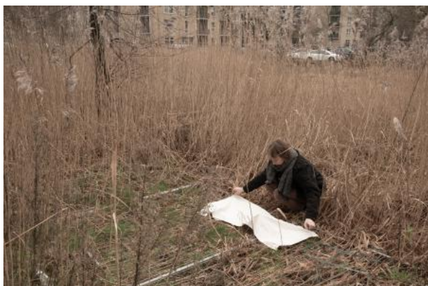
Process of "moving matter, fallow landscapes"., 2025 artistic research, workshops.