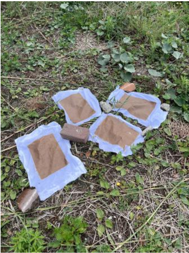
Fallow Forms, 2025