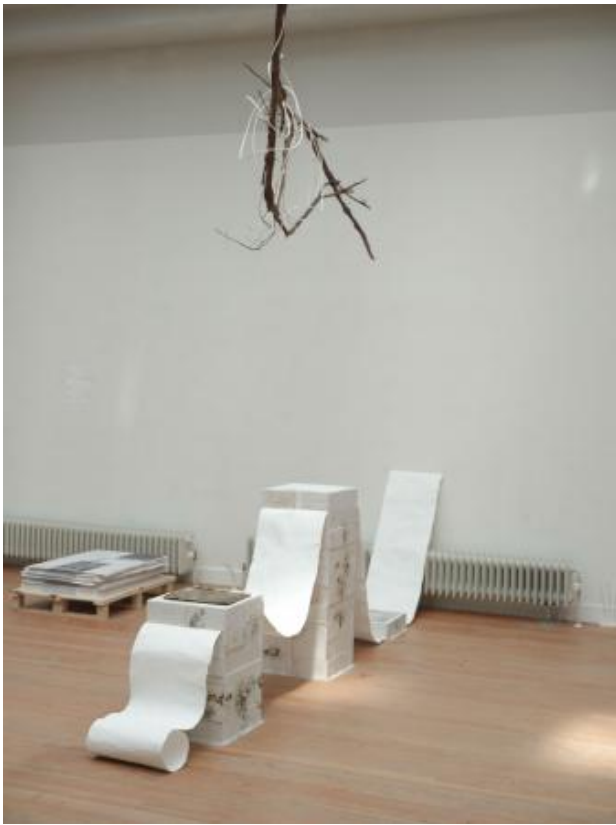
THE CLOUD IS A PLACE ON EARTH, 2024 Installation, participatory performance, publication