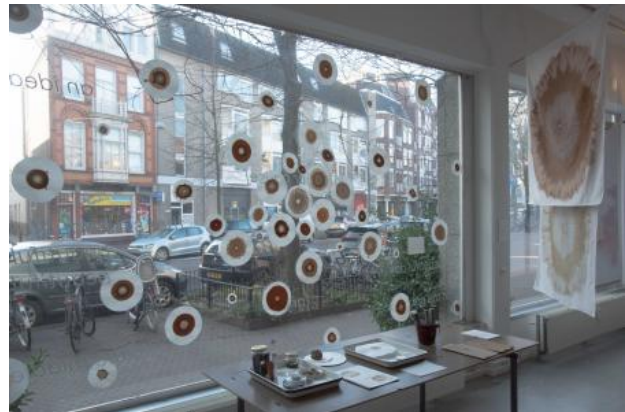
Terra Incognita, 2023 Chromatographs of soil and my body, workshops