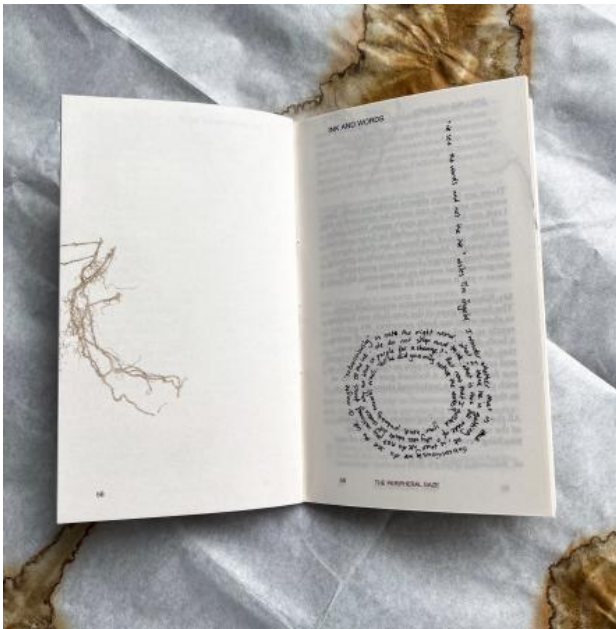
The first impression on your skin, 2024