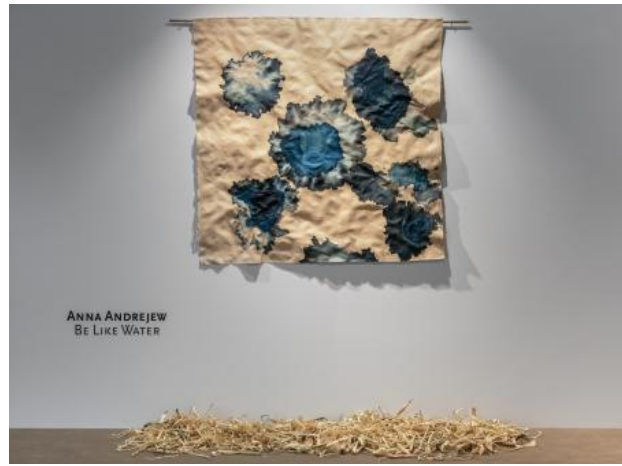
Be Like Water, 2024 Corn leaf paper, cyanotype, performance, 130x130 cm