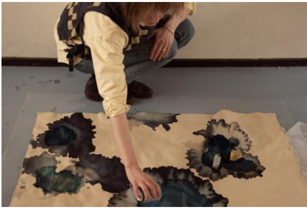
Be Like Water, 2024 Corn leaf paper, cyanotype, performance, 130x130 cm