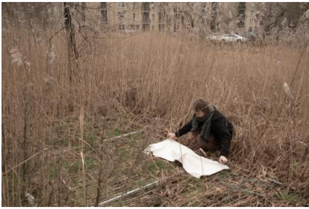
Process of "moving matter, fallow landscapes"., 2025 artistic research, workshops.