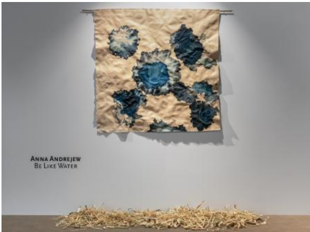
Be Like Water, 2024 Corn leaf paper, cyanotype, performance, 130x130 cm