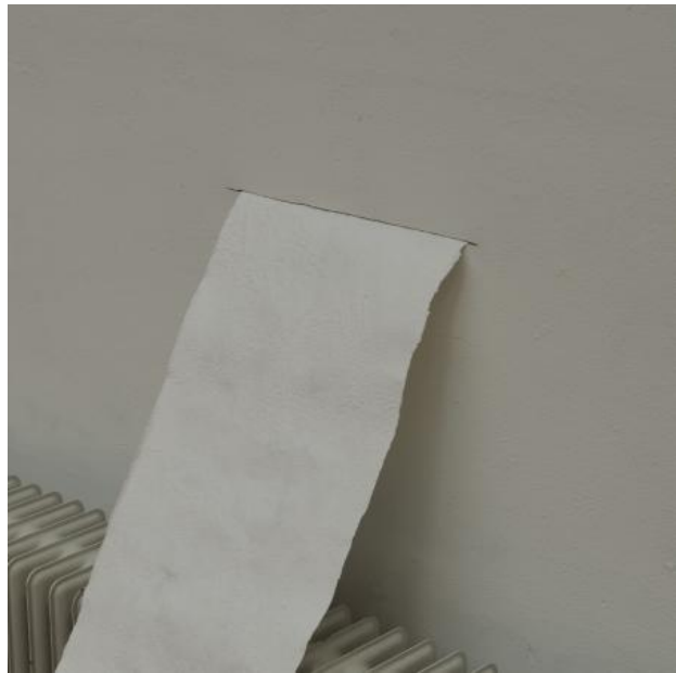
THE CLOUD IS A PLACE ON EARTH, 2024 Installation, participatory performance, publication