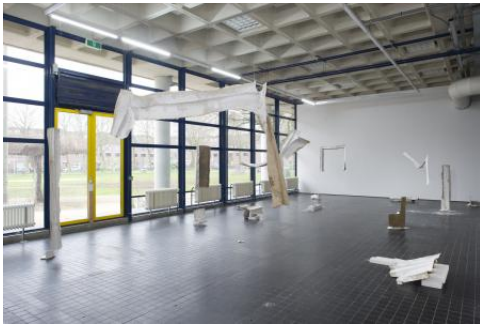
There is no home, like place, 2025 Walls of my former studio torn off and mounted onto linen canvases, dimensions variable