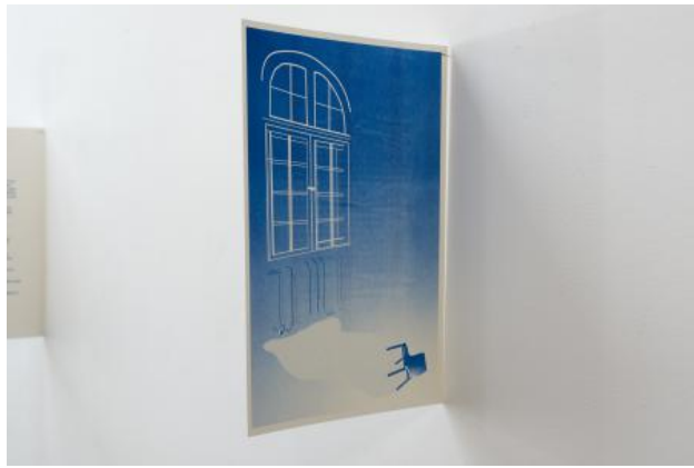
9 Possible Scenarios, 2025 Riso print on Arena Natural Smooth paper 300 g/m2., 29,7 x 42 cm