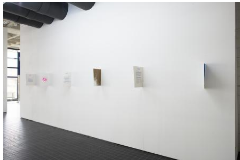
9 Possible Scenarios, 2025 Riso print on Arena Natural Smooth paper 300 g/m2, 29,7 x 42 cm