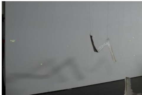
Locked Out In, 2025 Images from Al Jazeera News and Palestinians Instagram stories from Gaza, UV-phosphorescent pigments painted on the gallery walls, approximately 2 x 2,5 cm each painting