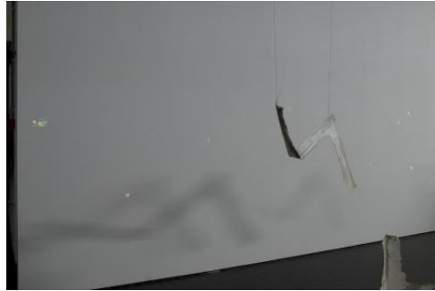
Locked Out In, 2025 Images from Al Jazeera News and Palestinians Instagram stories from Gaza, UV-phosphorescent pigments painted on the gallery walls, approximately 2 x 2,5 cm each painting