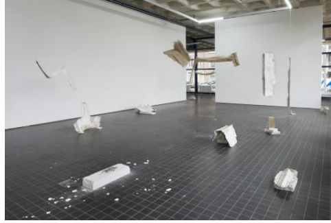
There is no home, like place, 2025 Walls of my former studio torn off and mounted onto linen canvases, dimensions variable