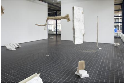
There is no home, like place, 2025 Walls of my former studio torn off and mounted onto linen canvases, dimensions variable