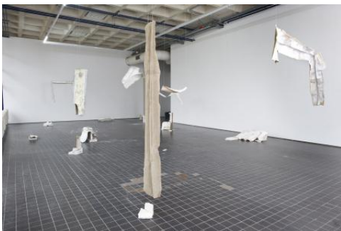
There is no home, like place, 2025 Walls of my former studio torn off and mounted onto linen canvases, dimensions variable