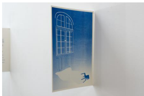
9 Possible Scenarios, 2025 Riso print on Arena Natural Smooth paper 300 g/m2., 29,7 x 42 cm