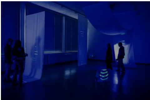
Night x Who Cares., 2026 Screenprints on textile and paper. Phosphorescent ink, Dimensions variable