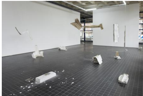
There is no home, like place, 2025 Walls of my former studio torn off and mounted onto linen canvases, dimensions variable