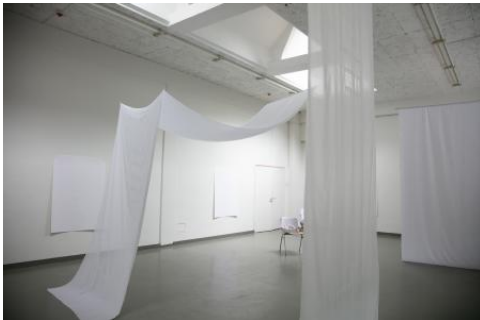
Night x Who Cares., 2026 Screenprints on textile and paper. Phosphorescent ink, Dimensions variable