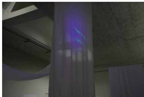
Night x Who Cares., 2026 Screenprints on textile and paper. Phosphorescent ink, Dimensions variable