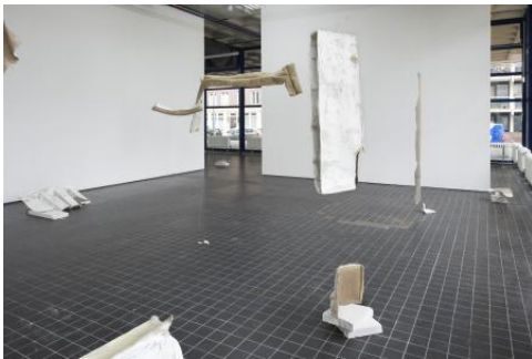
There is no home, like place, 2025 Walls of my former studio torn off and mounted onto linen canvases, dimensions variable