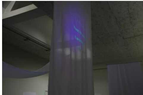
Night x Who Cares., 2026 Screenprints on textile and paper. Phosphorescent ink, Dimensions variable