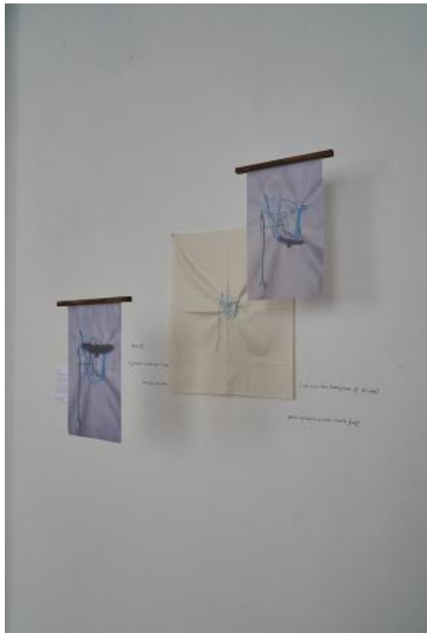
My present is more than I remember, 2023