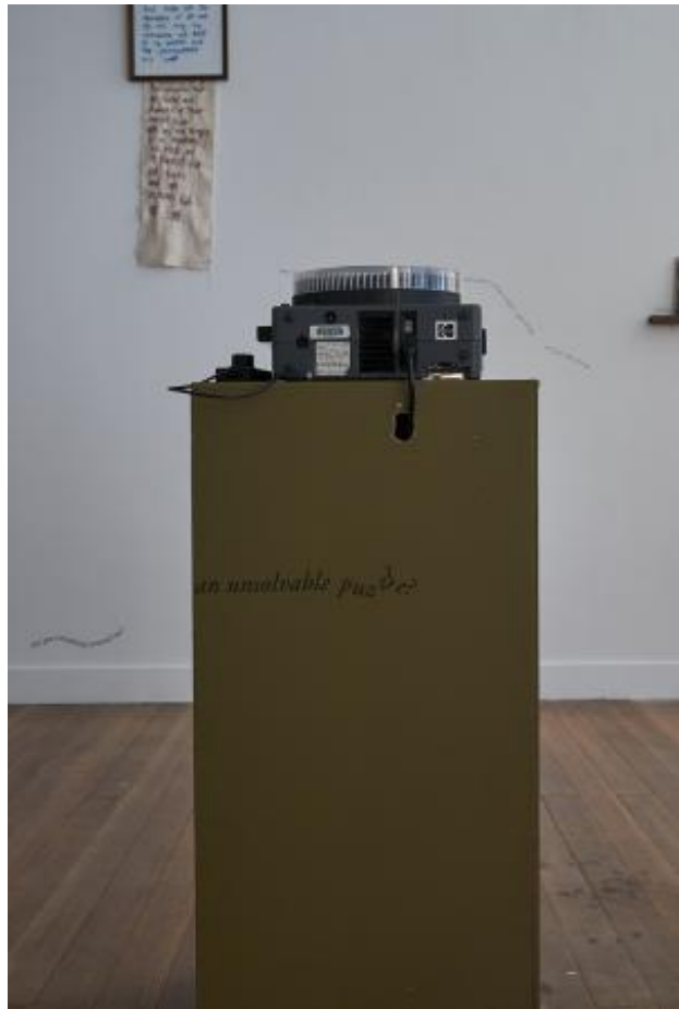
My present is more than I remember , 2023