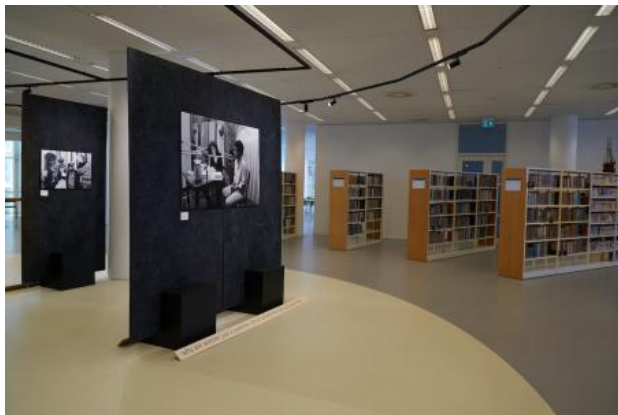
, 2024 text on wooden panels

2017 - Co-organiser of Munich's performance 2017 at the "Jewrovision 2017" (Annual, german-wide song and dance contest organised by the Jewish communities in Germany)