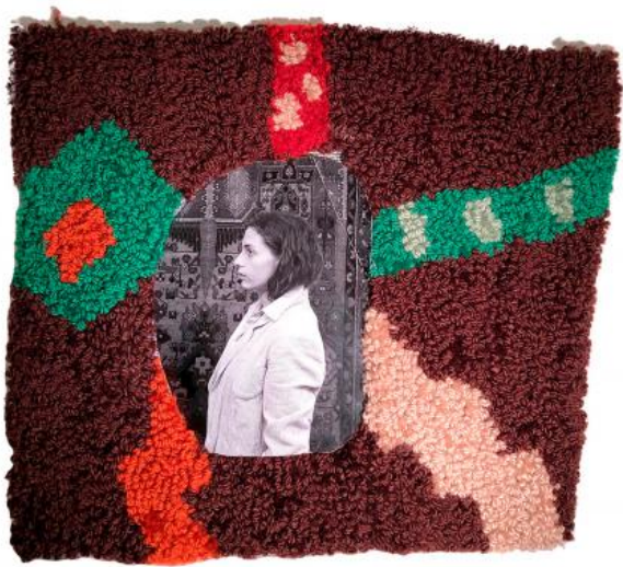
A carpet in a carpet is an image. , 2023 Photo print framed in punch-needed rug. , 23x28cm