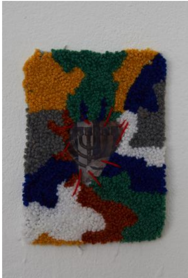
Lost objects , 2023 Photo print framed in punch-needled rug, 21x15cm