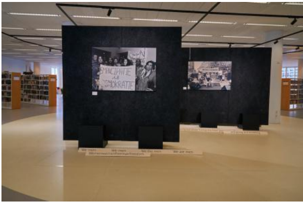
, 2024 text on wooden panels