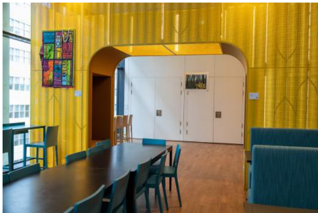
Artists work in horeca: 'In the shelves above the bars' , 2023 photo print sewn onto unbleached cotton.