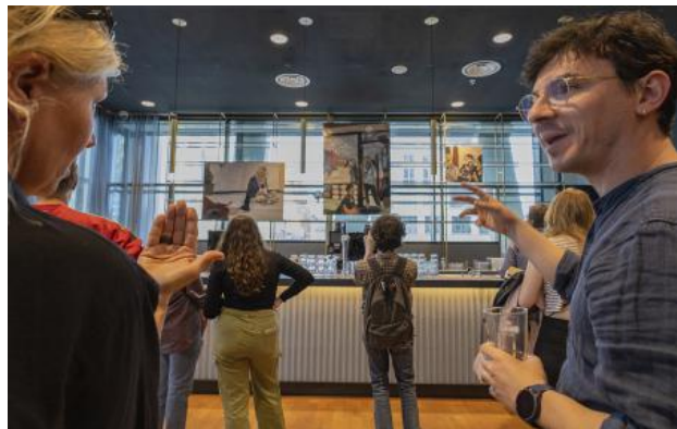
Artists work in horeca: 'In the shelves above the bars' , 2023