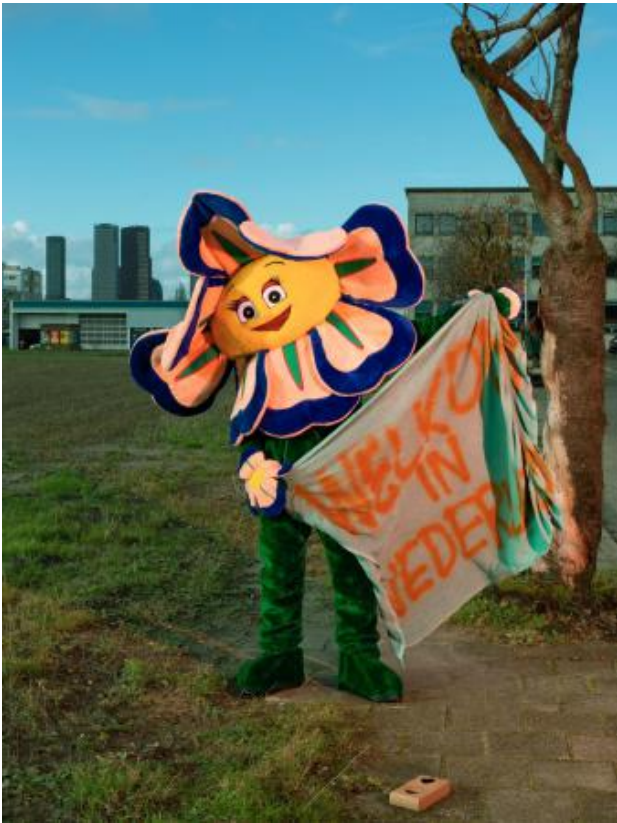
untitled, 2021 Photography