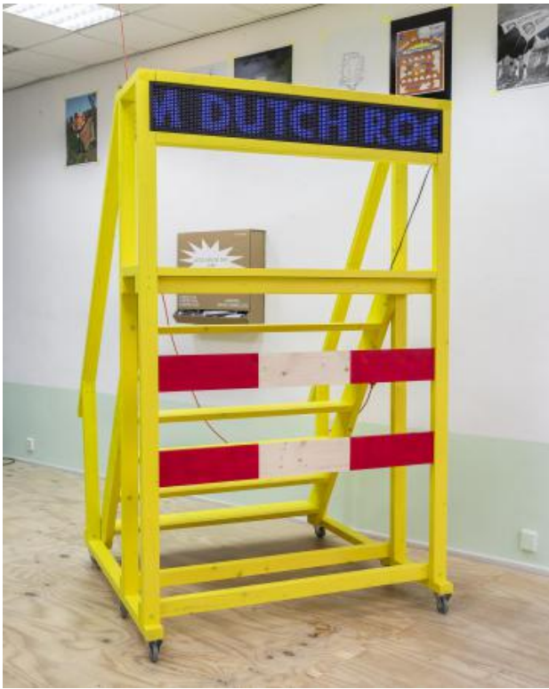
untitled, 2023 mixed media, aprox 150x130x210cm