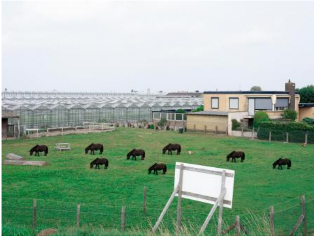
untitled, 2021 Photography and digital collage