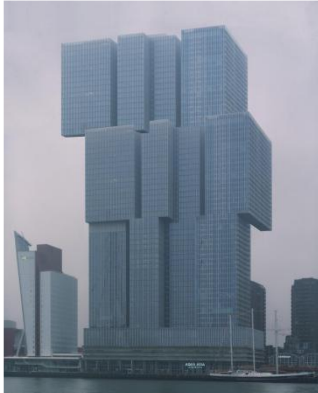
untitled, 2021 Photography and digital collage