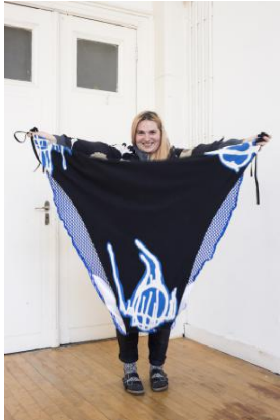
2019 Fabric, bleach , Dimensions variable