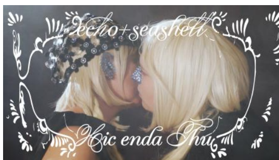
Hic enda Thu by echo+seashell (produced by Torus and Figurine) Video directed by Trees Heil , 2024 HD-video, stereo sound, 2min 8s