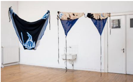
Once a Closely Guarded Secret, De Ateliers Offspring show 2019 , 2019 Mixed media, Dimensions variable