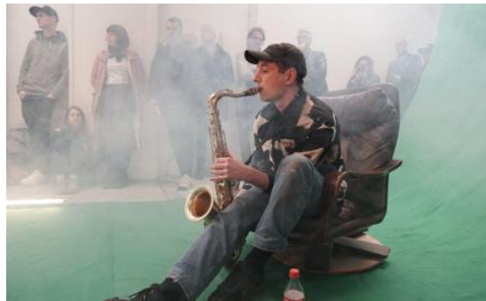
Tender Keys/Muddy Tongues , 2019 Performance, 20min15s