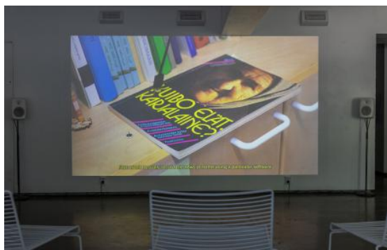
Minuška, short documentary, 2024 4K-video, stereo sound, 15min 48s