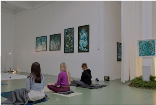
mindfulness program for visitors, during exhibition, 2024