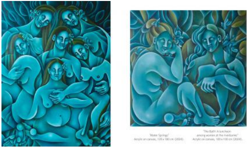
Two works: 'Water Springs' and 'The Bath', 2024 Acrylic on canvas, 160x120x4cm / 140x70x4cm / 140x70x4cm