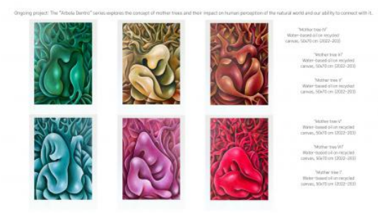
Mother Trees, 2024 Oil on water basis, on recycled canvas made of plastic bottles, All: 70x50x4cm