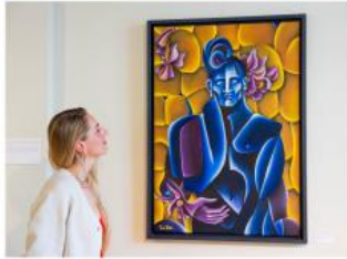
The recent exhibition 'Root to Rise' at the Westergaard in Amsterdam, from 9-28 June 2024. This gallery show discussed the fluidity of masculinity and femininity, as we celebrated the vibrant time of European Summer Solstice (or 'Midsummer') at the end of the month.