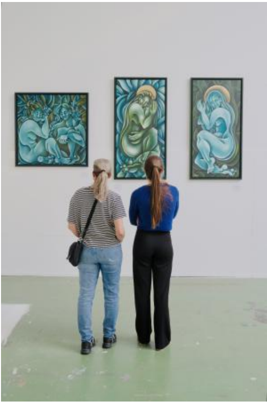
Visitors view three paintings " 'The Bath', 'Meandering River' and 'Sleeping River', 2024 Acrylic on canvas, 100x100x4cm / 140x70x4cm / 140x70x4cm