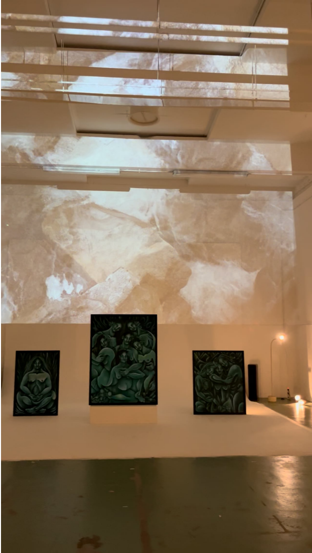
Impression of exhibition 'Body Currents' , 2024 30 seconden