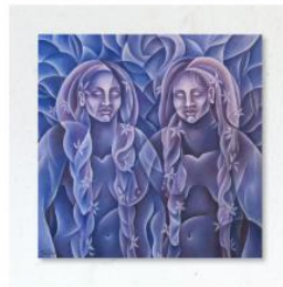
'Skin - scars from resilient women' Acrylic on canvas 90x90 cm (total). Available for sale.