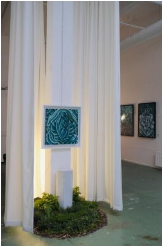
'Flood' - Installation, 2024 Acrylic on canvas, moss, ferns, local herbs such as thyme, shredded wood and soil., Painting: 60x60x5cm / Installation: Diameter of 120cm and height of 600cm