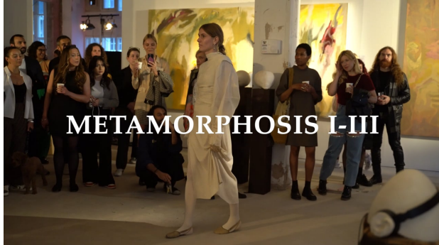
Metamorphosis I-III, performance, 2024 00:45