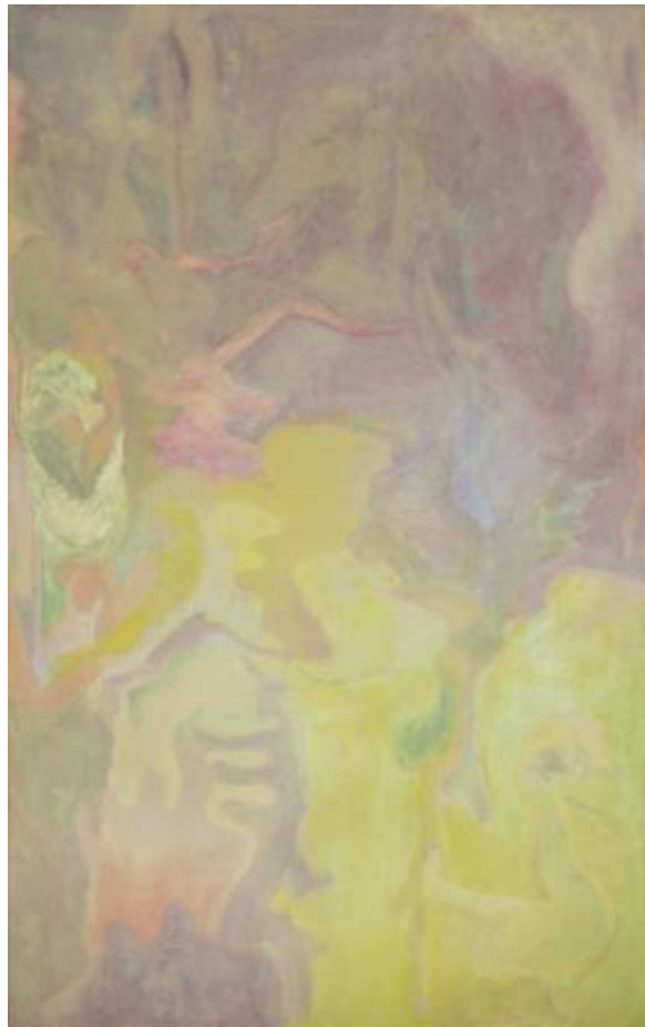
Sculpting Memories, 2024 Oil on linen, 210 x 130 cm