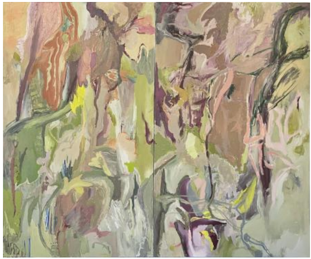
Morphing Bodies # 3, 2023 Diptych, oil on linen, 200 x 240 cm (200 x 120 cm each)