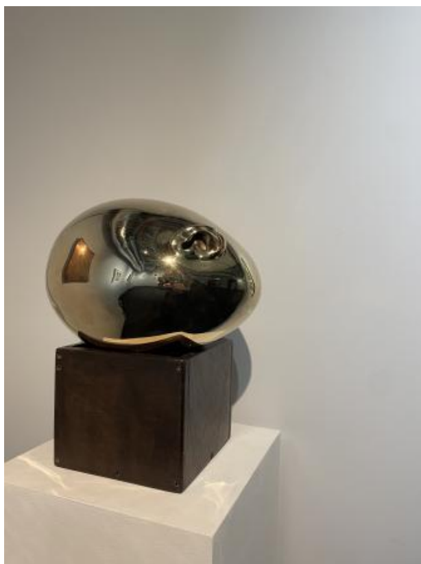
The Echo that Pulled Me from Slumber, 2024 Bronze, 29 x 21 x 24 cm