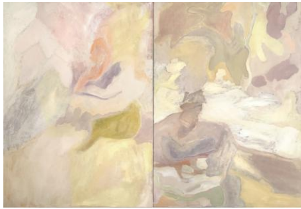
Revive, 2024 Diptych, oil on linen, 110 cm x 160 (110 x 80 cm each)