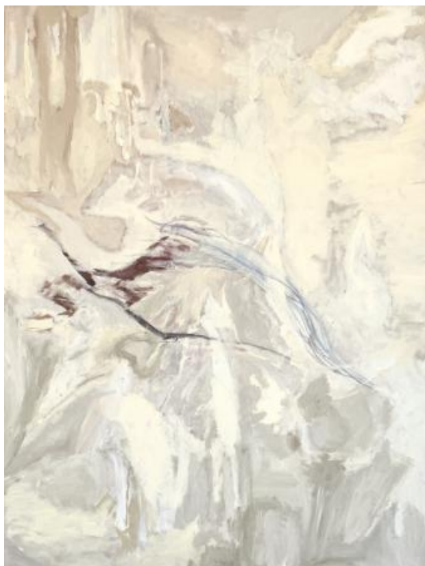
High tide, 2023 Oil on linen, 101.5 x 76 cm