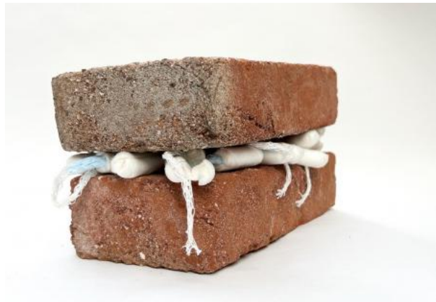
Mortgage denied, 2024 Mixed media