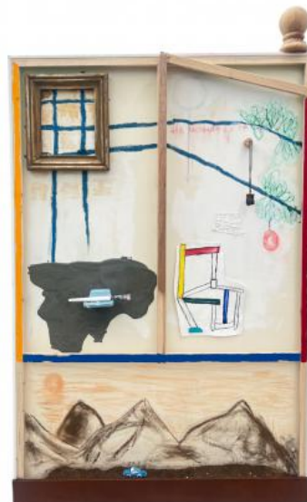
Framing Memorias, 2025