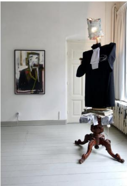
M.E (Metaphorical Existence), 2025