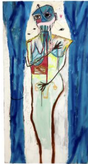
Suffering of Venus, 2024 Mixed media