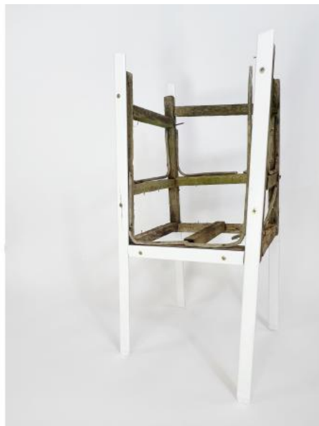
White construction, 2023 sculpture, nails, wood, painted wood