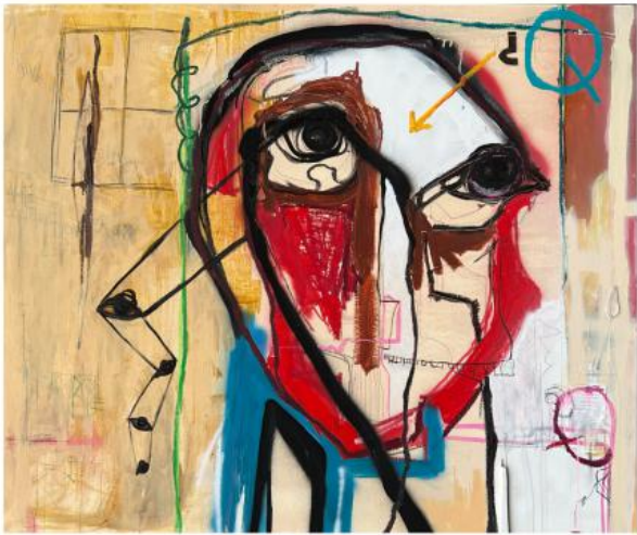
Luna de honing, 2023 Oil, acrylic, leather, oil pastels, oil sticks, graphite, acrylic spray paint, paper on canvas, 100x120