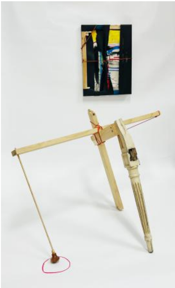
EQUILIBRIO LIBERADOR , 2024 Acrylic, Canvas, Wood, Rope