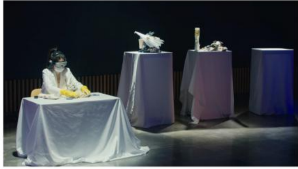
Means Nothing, 2024 Performance