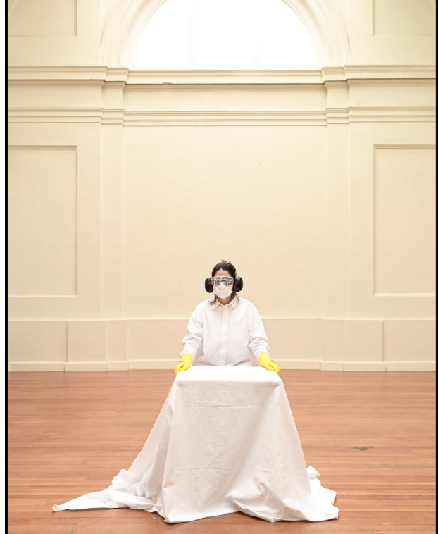
Means Nothing, 2024