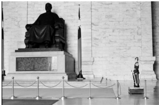
I tried to carry a statue with me , 2023 video installation, 15:55

2021 Take me somewhere nice See Lab The Hague, Netherlands As part of Hoogtij #66 www.seelab.nl/program/2021/takemesomewherenice-hoogtij66 Group