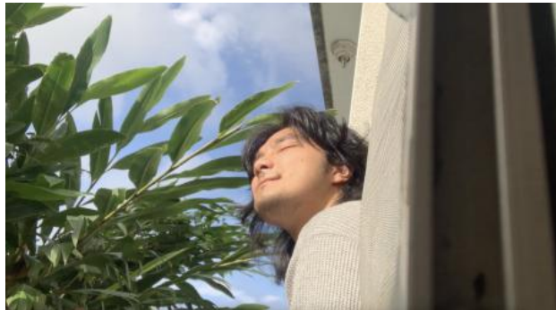
Li-Li Lak-Lak, 2022 single-channel video, 27:37