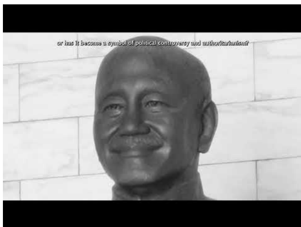
I tried to carry a statue with me, 2023 1:18