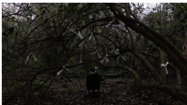
I tried to carry a statue with me , 2023 video installation, 15:55