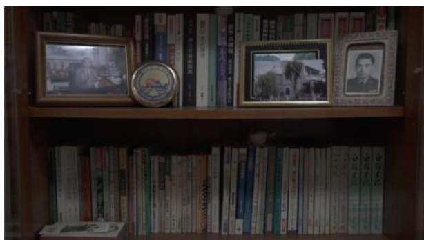
I tried to carry a statue with me , 2023 video installation, 15:55