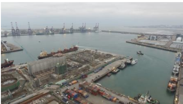
Li-Li Lak-Lak, 2022 single-channel video, 27:37