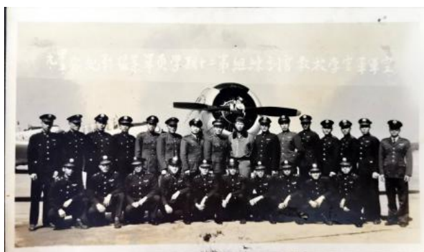
I tried to carry a statue with me , 2023 video installation, 15:55