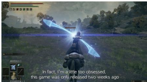
Li-Li Lak-Lak, 2022 single-channel video, 27:37