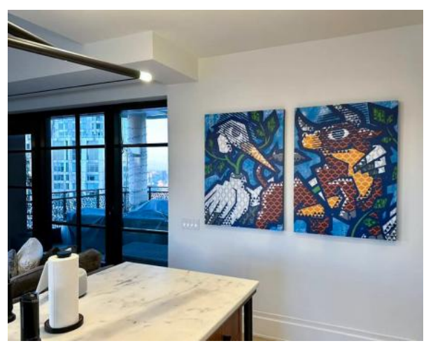
, 2023 Spraypaint on wood, 70x100cm (x2)