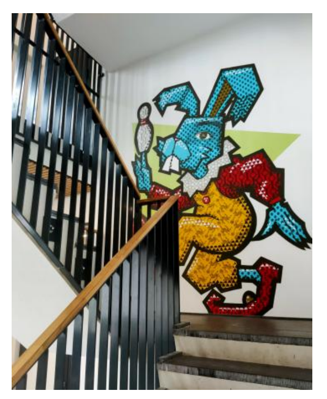
Knijn Bowling and Restaurant, 2023 Spraypaint