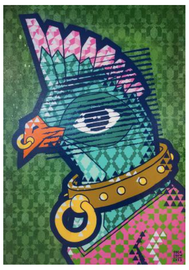
Mx. Destiny , 2023 spraypaint on wood, 70x100cm