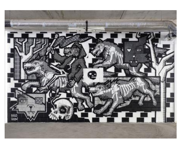
Wolves, 2022 spraypaint, +/- 3x10m