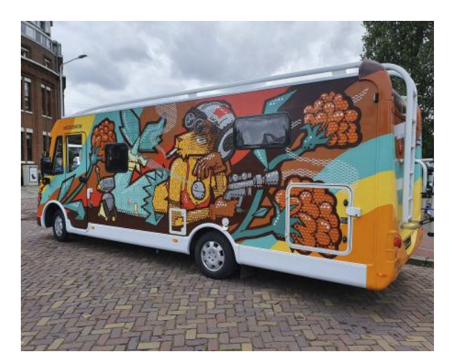
Campervan, 2022 spraypaint