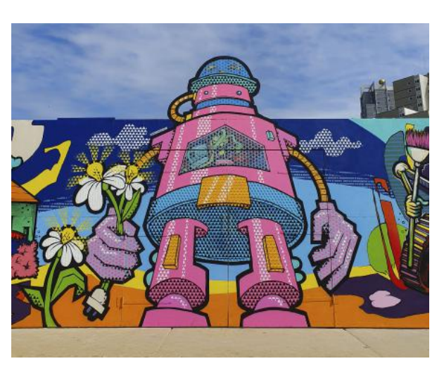
Smart At Sea, 2022 Spraypaint, 3x100m