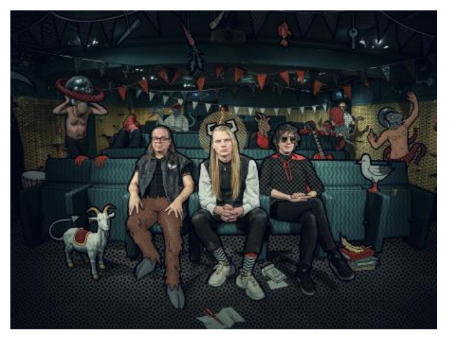
Prins S en de Geit press images, 2023 Digital art