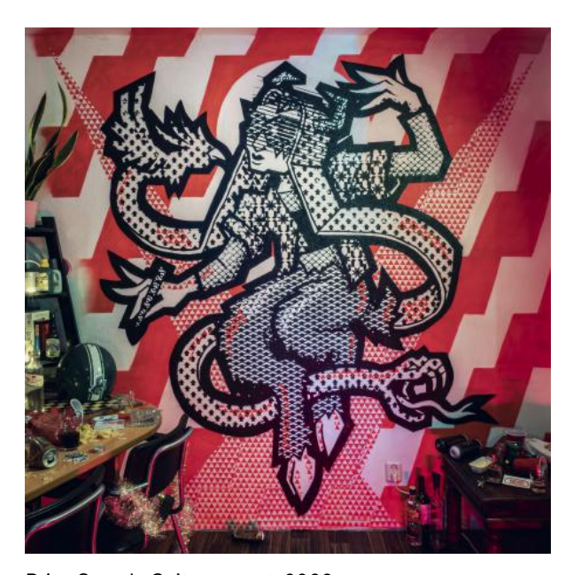
Prins S en de Geit cover art, 2023 Mixed media