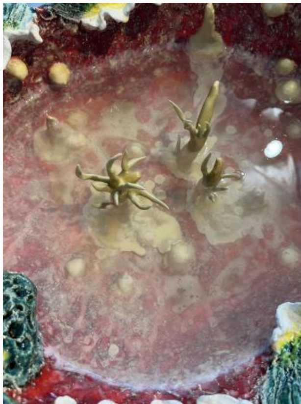
Corpse Flower, 2023 Clay, glaze, nature latex

Discarded steel tube, nature latex, clay, metallic pigment, ceramic glaze and dried sea lavender, 40 x 17 x 55 cm