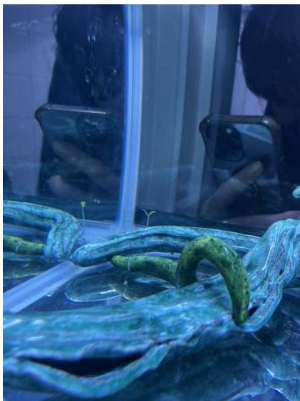
Some Breathe Through Their Butts, 2023 Clay, naturelatex, aquarium, ceramic glaze, 40 x 40 x 40 cm