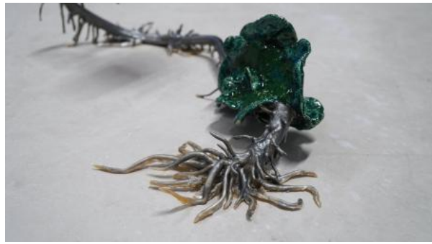
This Year Taught Me Something About Roots and Mortality, 2023 Discarded steel tube, nature latex, clay, metallic pigment, ceramic glaze and dried sea lavender , 40 x 17 x 55 cm