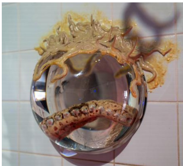
Some Breathe Through Their Butts, 2023 Clay, naturelatex, aquarium, ceramic glaze, 25 x 30 x 20 cm

Some Breathe Through Their Butts, 2023 Full room multimedia installation in 2 functioning bathrooms; Clay, naturelatex, steel, wire, ceramic glaze, pigment, aquariums, aquarium pumps, 3 x 3 x 3,5 m