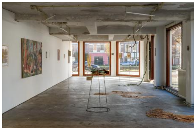
Hybrid Realms, 2023