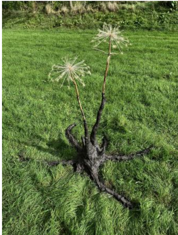
Friendly Giant Hogweed or Momentary Protection of Defense Mechanisms / Momentary Protection against Rain, Sunshine, and Hail, 2023 Drenthe clay, giant hogweed