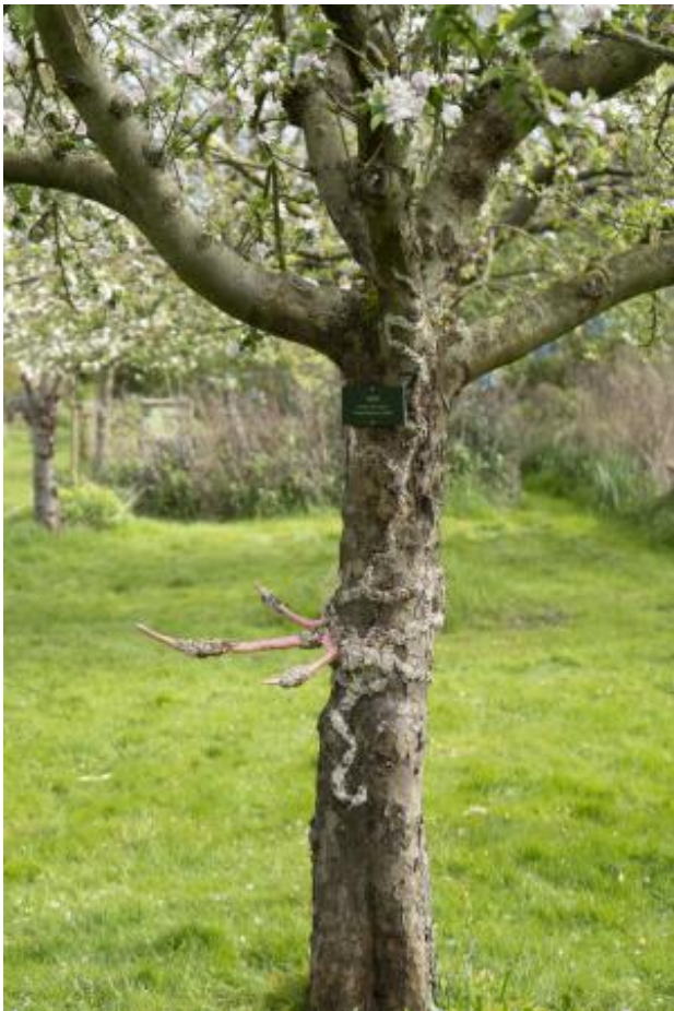
Birds! Birds! Birds! (To Everything There is a Season), 2024 Ceramics, bird seeds, Various