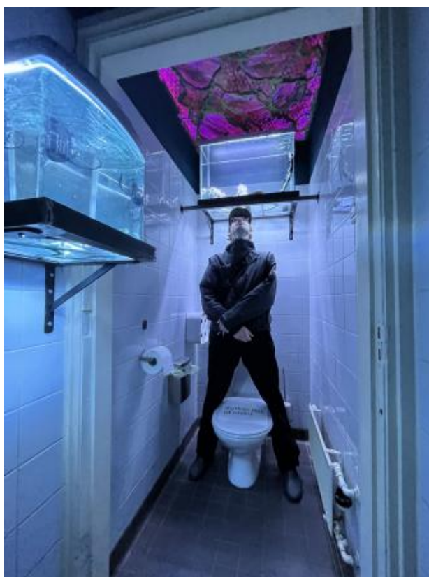
Some Breathe Through Their Butts, 2023 Full room multimedia installation in 2 functioning bathrooms; Clay, nature latex, steel, wire, ceramic glaze, pigment, aquariums, aquarium pumps, 3 x 1 x 3,5 m