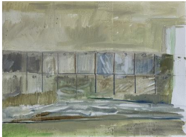
Untitled, 2024 oil on paper, 40x30