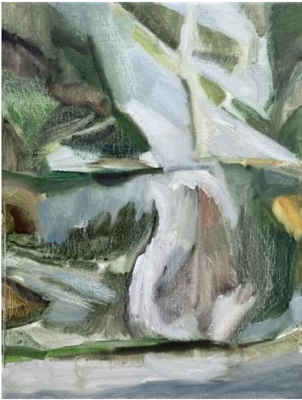
Untitled, 2024 oil on linen, 30x40