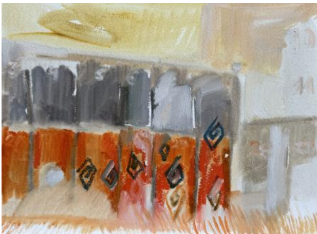
Untitled, 2024 oil on paper, 30x20