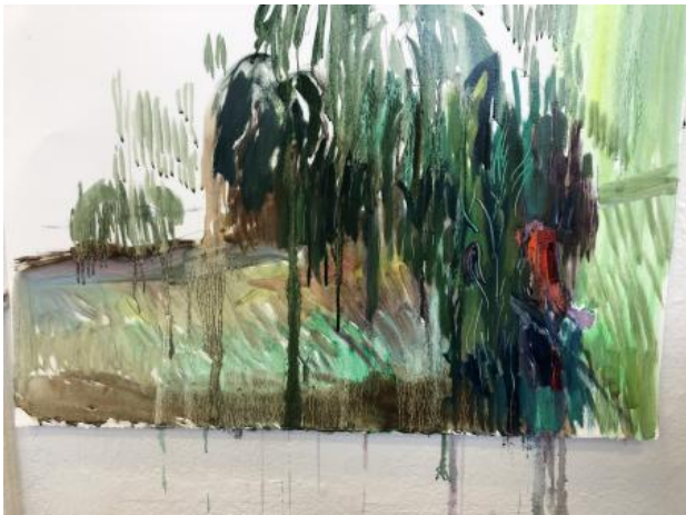
Untitled, 2022 oil on paper, 75x55