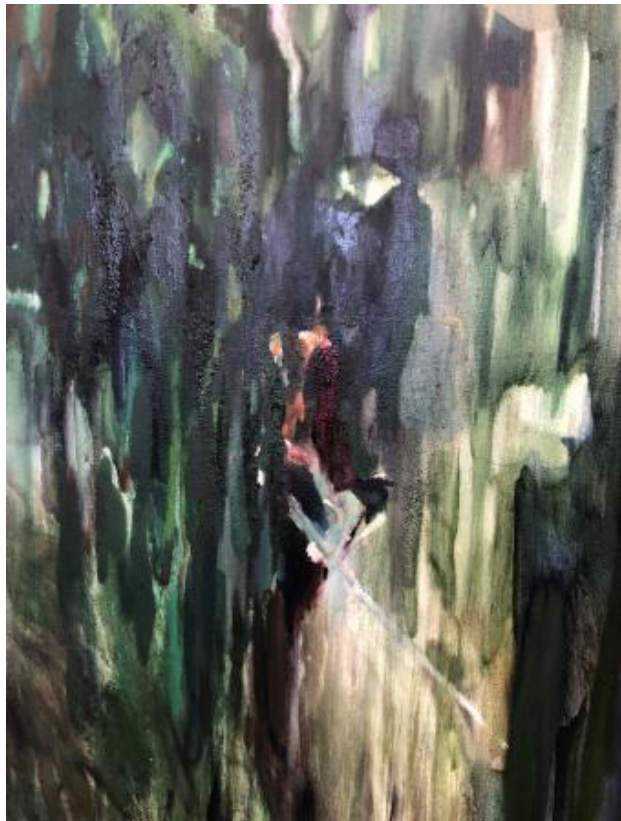
The catcher in the rye 2022, 2022