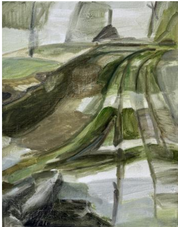
Untitled, 2024 oil on linen, 40x50