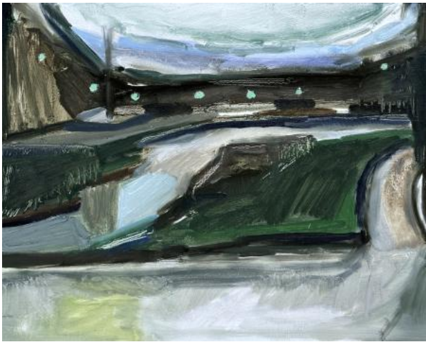
Untitled, 2025 oil on board, 30x24

2024 Buning Brongers Prize Netherlands Nomination