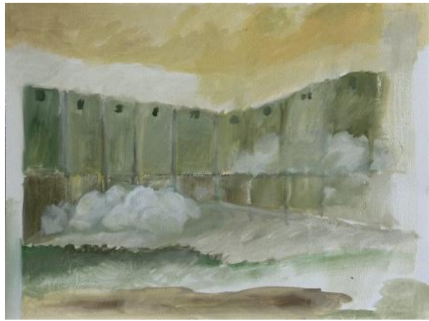
Cloud wall, 2024 oil on paper, 40x30