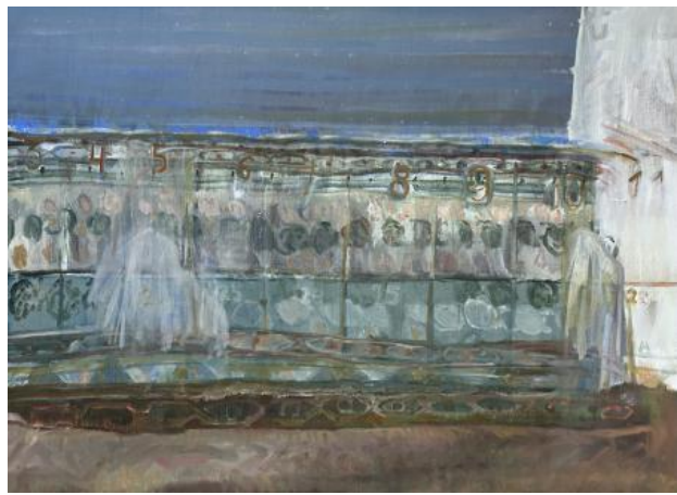
Untitled, 2024 oil on linen, 135x100