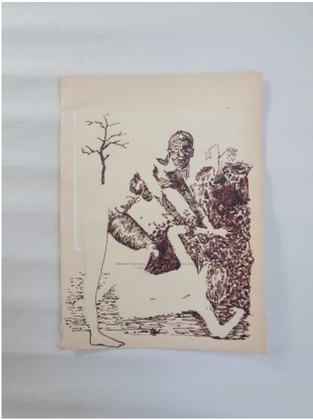
Henna Drawing, 2020 henna paste, paper from old renoir photobook, 40x25cm