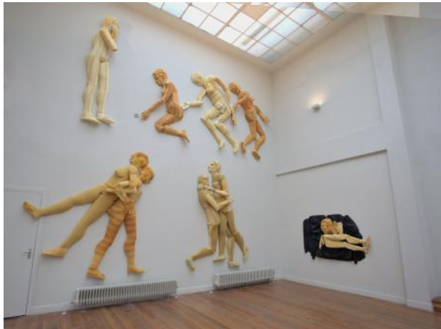
Neighboring tides and old currents, 2023 Reused furniture foam., 8x0.5x6m