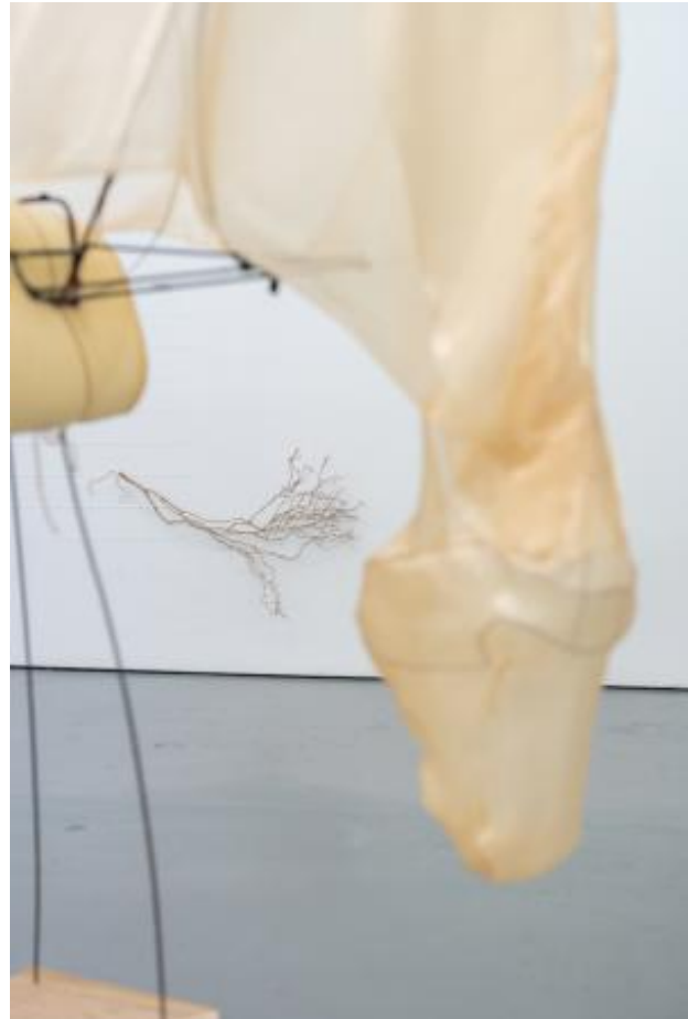
Horse 1 & Horse 2, 2022 Metal, textile, speakers, vibration+sound loop., 2,5x0.7x1.8