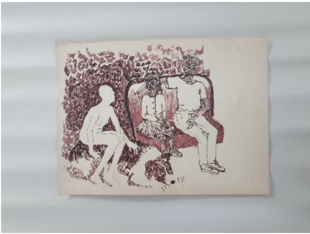
Henna Drawing, 2020 henna paste, paper from old renoir photobook