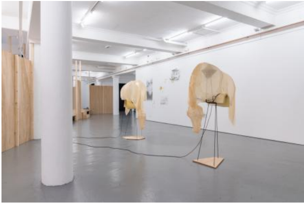
Horse 1 & Horse 2, 2022 Metal, textile, speakers, vibration+sound loop., 2,5x0.7x1.8

'Motionless not moving a muscle or twisting a finger' In collaboration with Mila Narjollet Metal, textile, sound, heat, vibration ] Personifying the car, warm, shaking, rumbling. What are you when you're driving? Part of group exhibition 'A duffel bag f, 2022 Metal, textile, sound, heat, vibration, 3x2.5x1m