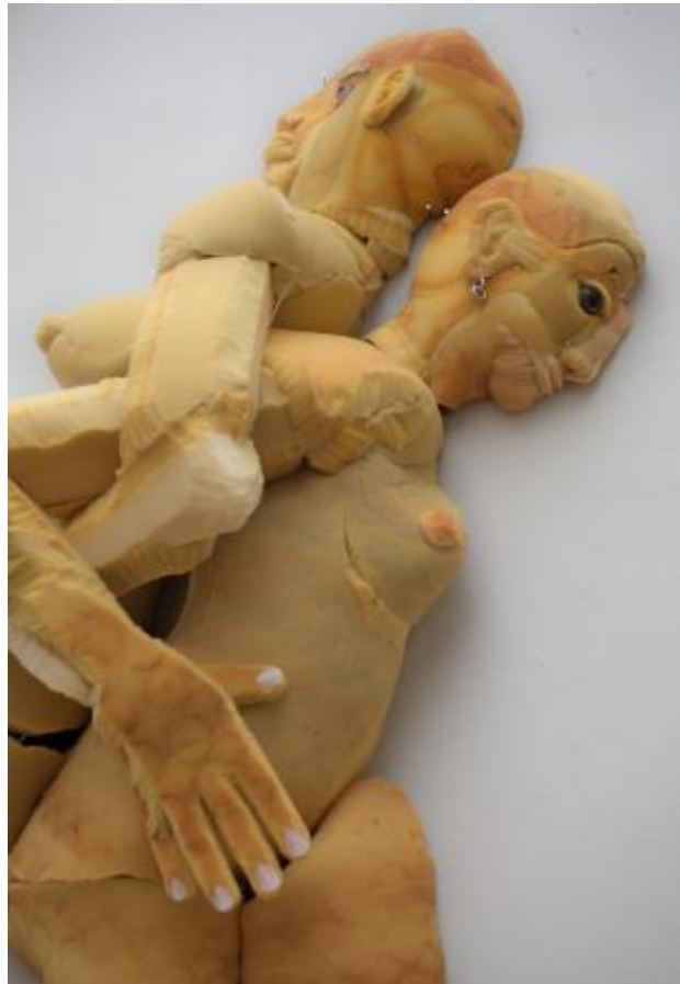
Neighboring tides and old currents, 2023 Reused furniture foam, 2.75x0.5x3m