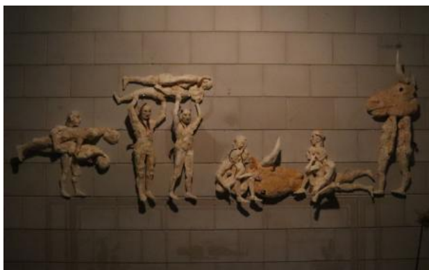
We hid devils in the shapes of strangers//End of the Auroch, 2022 Reused PUR foam, beeswax, pigment, my own hair, slip clay, 5x0.3x2m