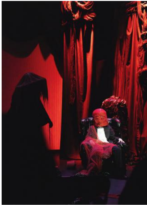
Garbage Mansion, 2025 Immersive installation, performance