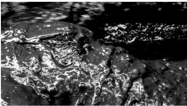
Mother and Sister, 2022