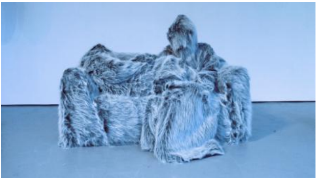
Dreaming in Blue, 2023