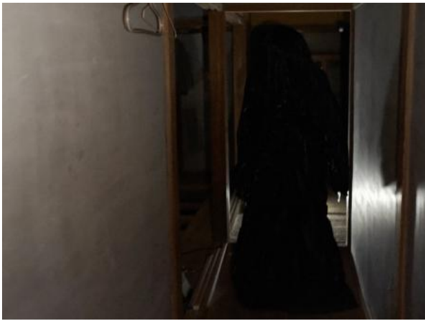
The Forgotten Sacrifice, 2025 Video, 7 minutes