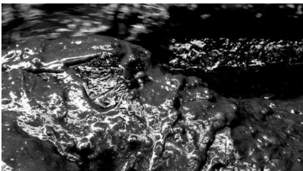
Mother and Sister, 2022