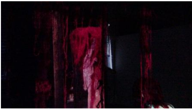
Oiwa, 2023 Mixed media installation, 3 x 2 x 2 m