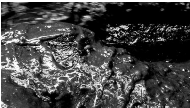
Mother and Sister, 2022