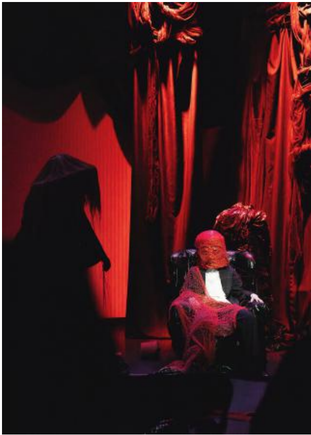
Garbage Mansion, 2025 Immersive installation, performance