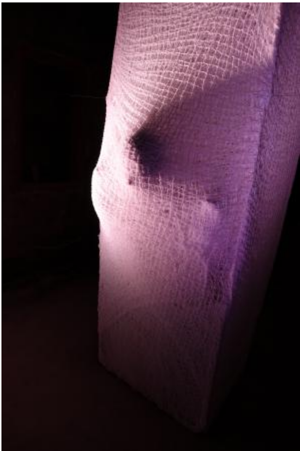
Soft Systems, 2025 Performance, installatie, 1,5x1,5x2m