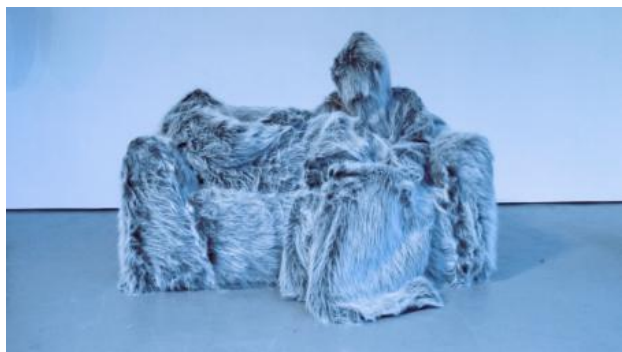
Dreaming in Blue, 2023