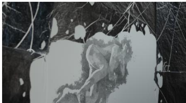
Burrow, 2023 Graphite on wood, 600 x 120 x 265 cm