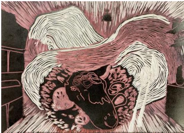
Mammal/Meal, 2021 Linoleum, monotype ink, white spirit, 42 x 29.7 cm