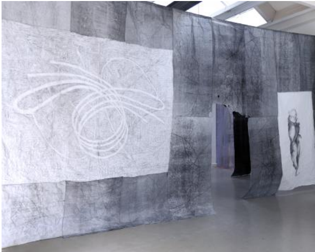
Burrow, 2023 Monotype ink, graphite, patternmaking paper, sewing thread., 600 x 120 x 265 cm