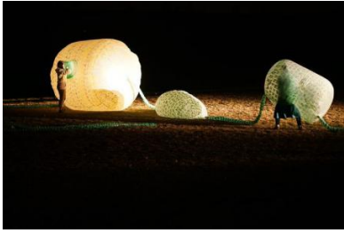
Invitation à être une balle de paille., 2022 Performance