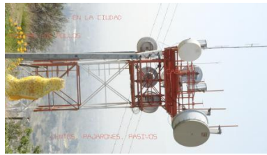
Andar como pollo, 2021 Video performance