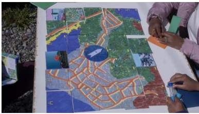
Yo quiero aquí Melinka, 2020 Social Practice