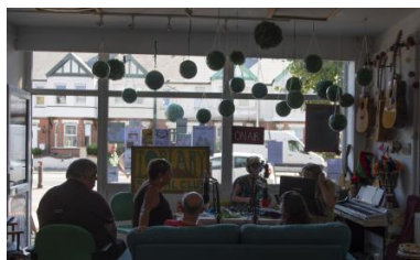
Topiary Social Club: The Topiary Room, 2022 Social Practice