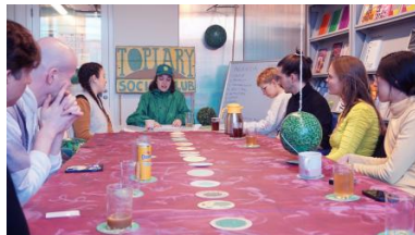
Topiary Social Club: Board Meeting, 2023 Social Practice