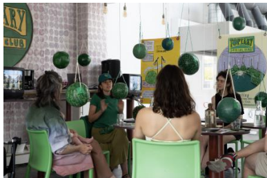
Topiary Social Club: Board Meeting, 2023 Social Practice