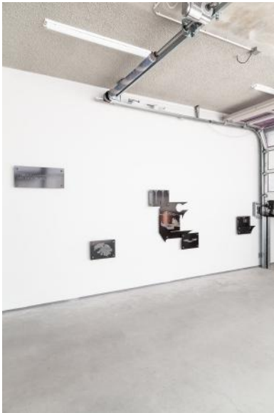
Ferocious Molten Metal Has The Potential To Prevail, 2023 laser-cut and powder-coated steel

2020 - 2023 Co-editor and artistic director of U&K Magazine, a publishing platform from Budapest, Hungary