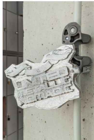
United, Metallic, Nomadic, 2023 cast aluminium, motorcycle dashboard holder