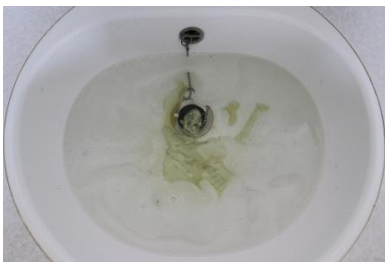
OUTSIDE THE HOSPITAL DOORS, 2024 3d printed sculpture made in resin,