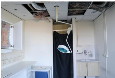
OUTSIDE THE HOSPITAL DOORS, 2024 Mixed media, Variable dimensions