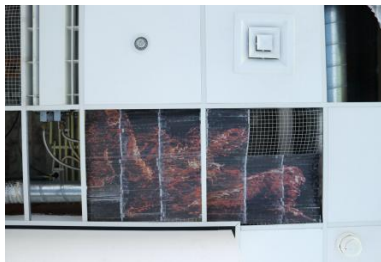
OUTSIDE THE HOSPITAL DOORS, 2024 Metal grid with scotch tape intertwined, Variable dimensions using A4 as a module