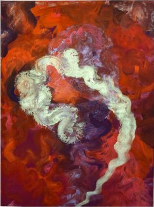
Spirit, 2026 Layover acryl on existed painting, 60*80*2