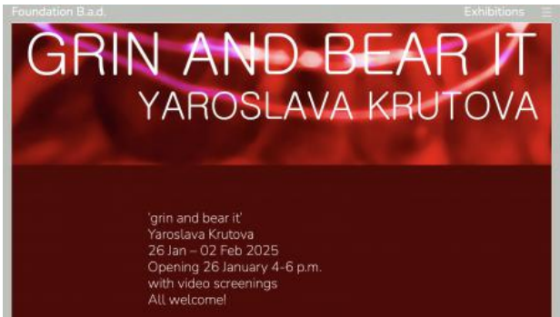
Grin and bear it, 2025 Mixed media