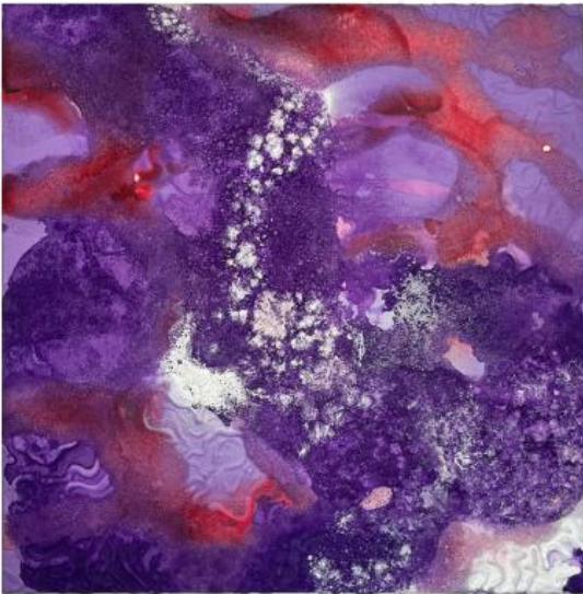
Smile, 2026 Layover acryl on existed painting, 30*30*3