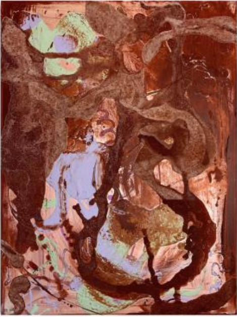
Tierra de Siena Tostada, 2026 Acryl, 80*60*2