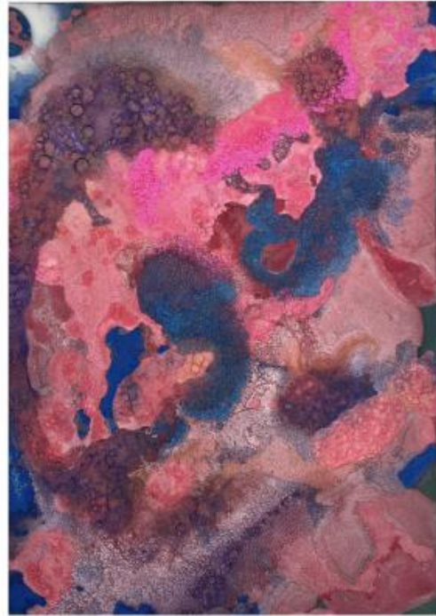
, 2026 Layover acryl on existed painting, 50*70*2