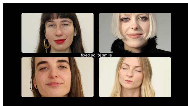
GRIN AND BEAR IT, 2025 2:56