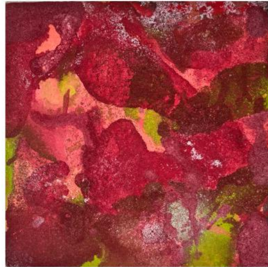
Peonies, 2026 Layover acryl on existed painting, 30*30*3