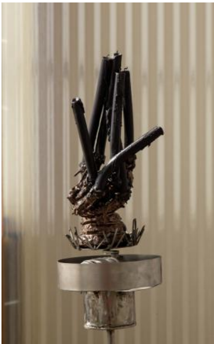
Spinning candle holder, 2022 Metal stand, windshield wiper motor, ceramic sculpture, wax candles