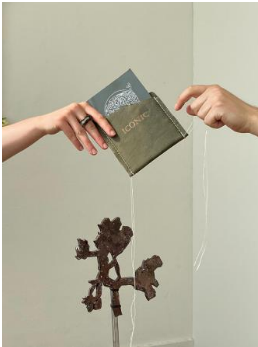
Iconic, 2022 Printed booklet, custom leather letter pressed pocket