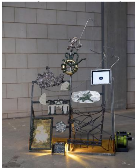
My Altar, 2021 Metal construction, glazed ceramics, Ipad with touch generated motivational quotes , 60 x 100 x 130