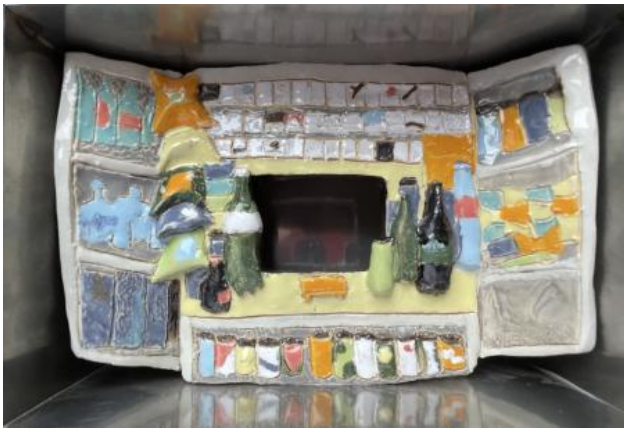
Klekshop, 2023 Glazed ceramics, metal box, 18 x 8 x 13 cm.