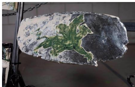
My Altar detail, 2021