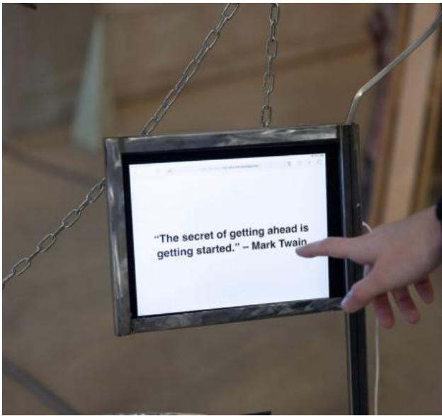
My Altar detail, 2021