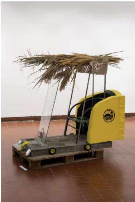
Tractor, 2022 Concrete wood metal glass styrofoam dried pampas plastic details, 160 x 90 x 120 cm.