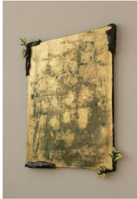
Iconic Painting, 2022 Gold leaf on canvas, ceramic frame, 80 x 100 cm.