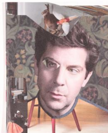
20230107, 2023 Cut-up, 28x22 cm.