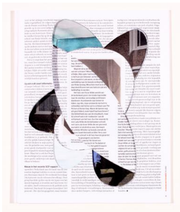
De Groene Amsterdammer 16 March 2023, 2023 Cut-up, 29,0 x 22,8 cm.