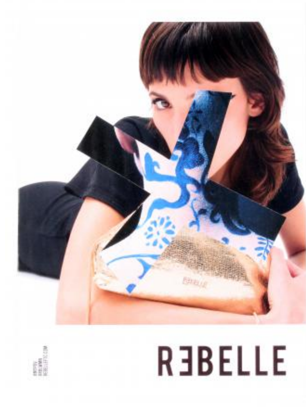
Vogue Italia maart 2023 - 5, 2023 Cut-up, 28,3 x 20,5 cm.