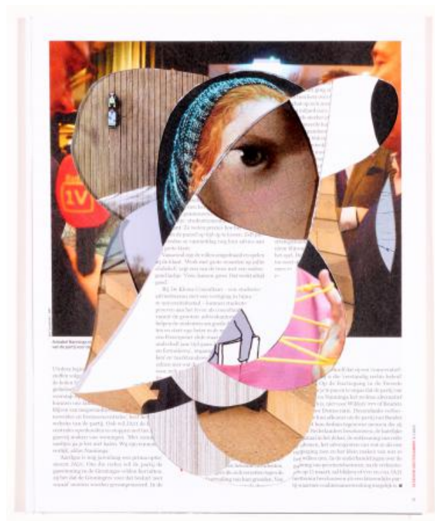
De Groene Amsterdammer 9 march 2023, 2023 Cut-up, 29,0 x 22,8 cm

2006 - Course leader and professor Master 2013 Editorial Design, HKU