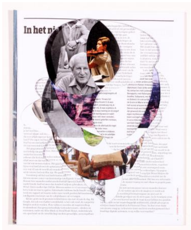
De Groene Amsterdammer 13 April 2023, 2023 Cut-up, 29,0 x 22,8 cm.