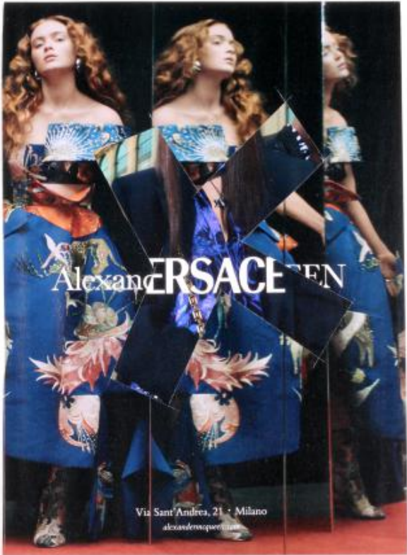
Vogue Italia maart 2023 - 3, 2023 Cut-up, 28,3 x 20,5 cm.