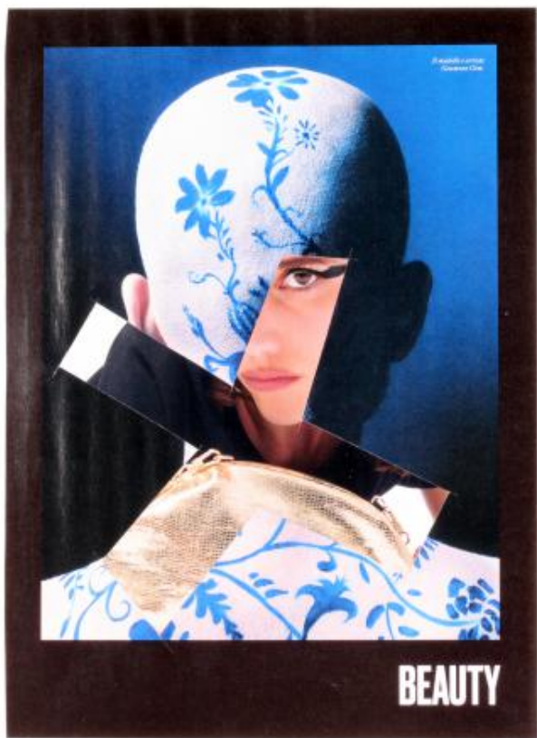
Vogue Italia maart 2023 - 4, 2023 Cut-up, 28,3 x 20,5 cm.