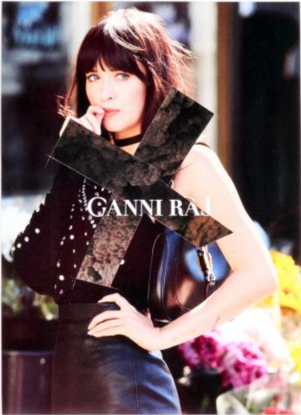
Vogue Italia maart 2023 - 2, 2023 Cut-up, 28,3 x 20,5 cm.