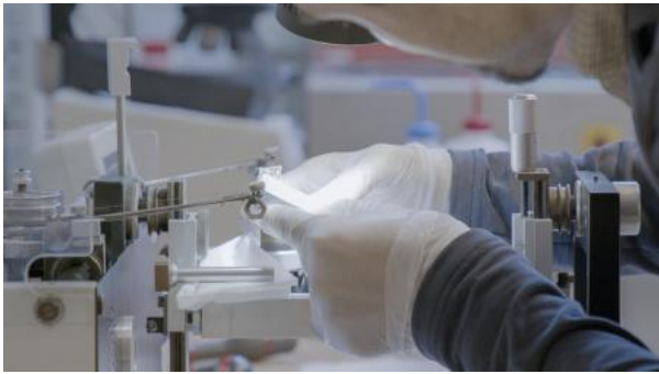
'Hard Drives from Space', 2022 Immersive installation