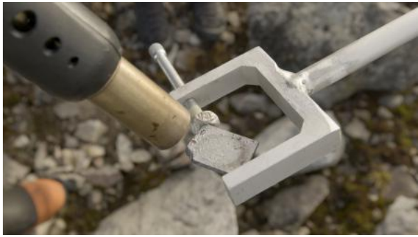
'Hard Drives from Space', 2022 Immersive installation