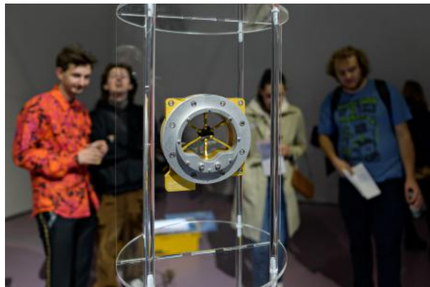
'Hard Drives from Space', 2022 Immersive installation