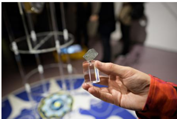
'Hard Drives from Space', 2022 Immersive installation