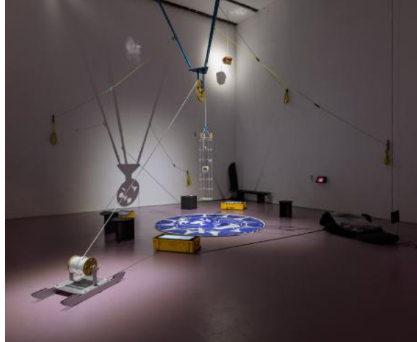
'Hard Drives from Space', 2022 Immersive installation