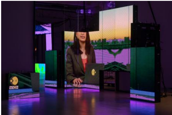
'LAWKI—ALIVE', 2021 Immersive installation