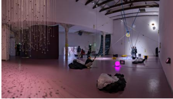
'Hard Drives from Space', 2022 Immersive installation