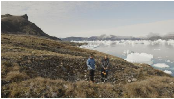
'Hard Drives from Space', 2022 Immersive installation