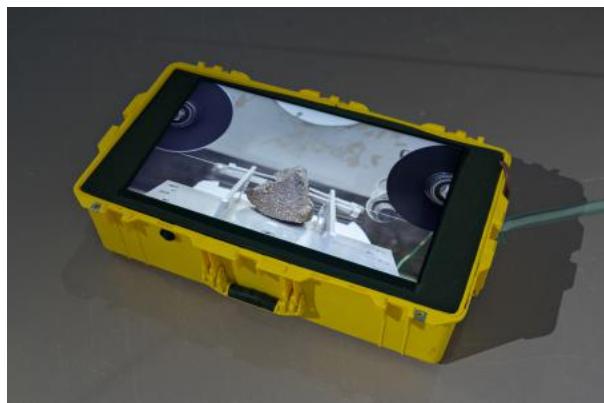
'Hard Drives from Space', 2022 Immersive installation