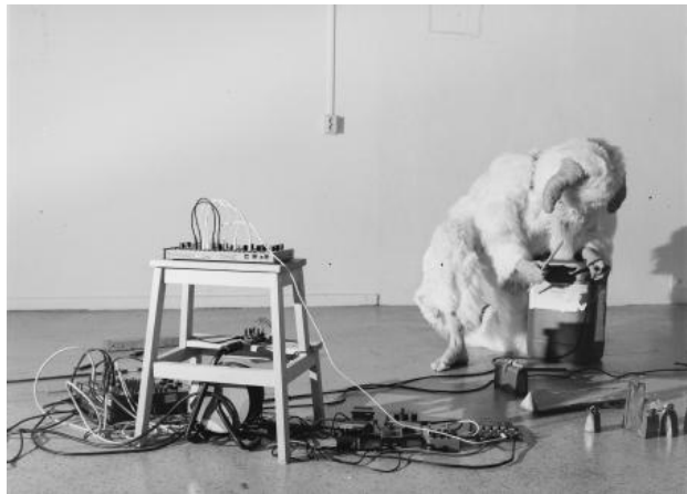
"Uyksz", 2025 photo of a performance