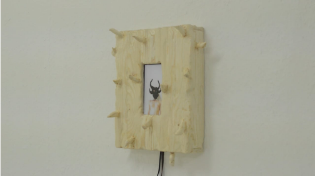
Synthetic Softness, 2024 06:20