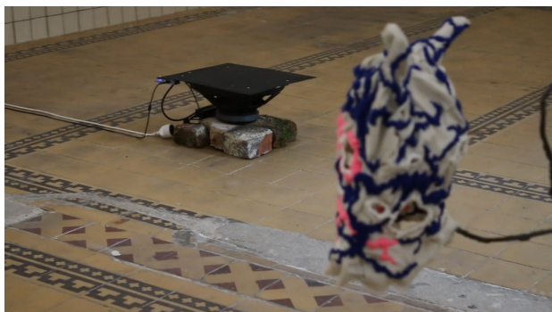
Uyksz, 2025 02:34