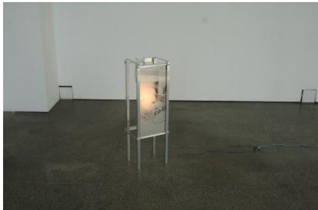
"Lightbox n1", 2025 aluminium, glass, print, lightbulb, 22cmx25cmx60cm