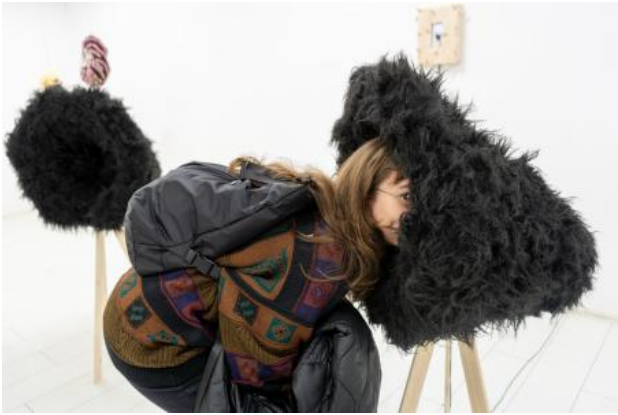
Synthetic Softness, 2024 Audio-visual Installation, 250x325x140cm