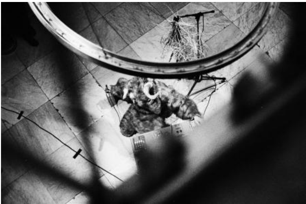
Bells and Costumes, 2024 performance, variable