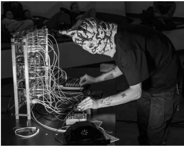
"Uyksz", 2025 photo of a performance