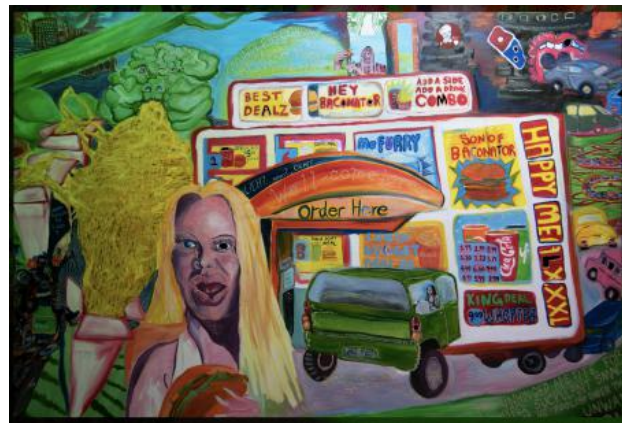
A Mukbang Love Story , 2022 Oil on Wood with engraving , 200 cm x 160 cm