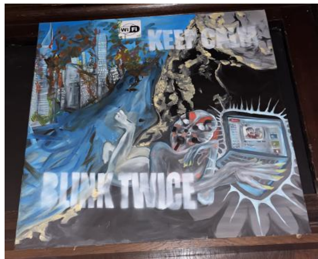
XIE3LLA: KEEP CALM BLINK TWICE , 2022 Oil and spray paint on Canvas, 1M X 1M