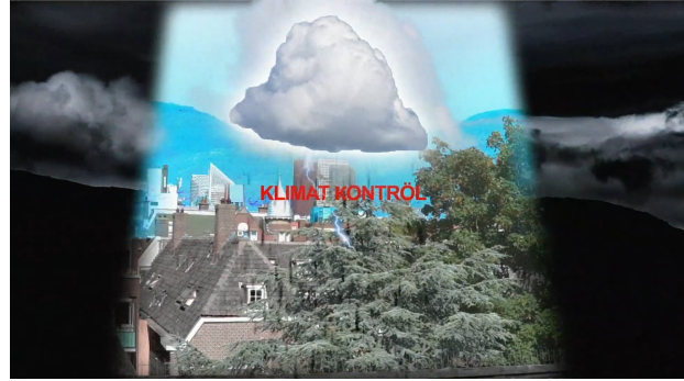
Climat Kontrol , 2022 12:17