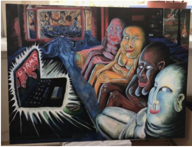
The End of the World; WORMZ, 2020 Oil on Canvas , 100 cm x 80 cm 0