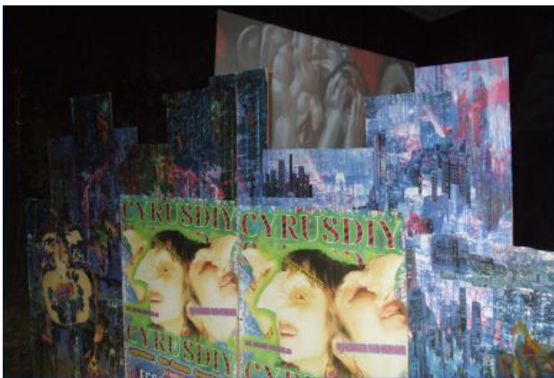
The Unfortunate Promise of CYRUS DIY , 2021 Photo collage and Acrylic on Wood , 300 cm x 200 cm