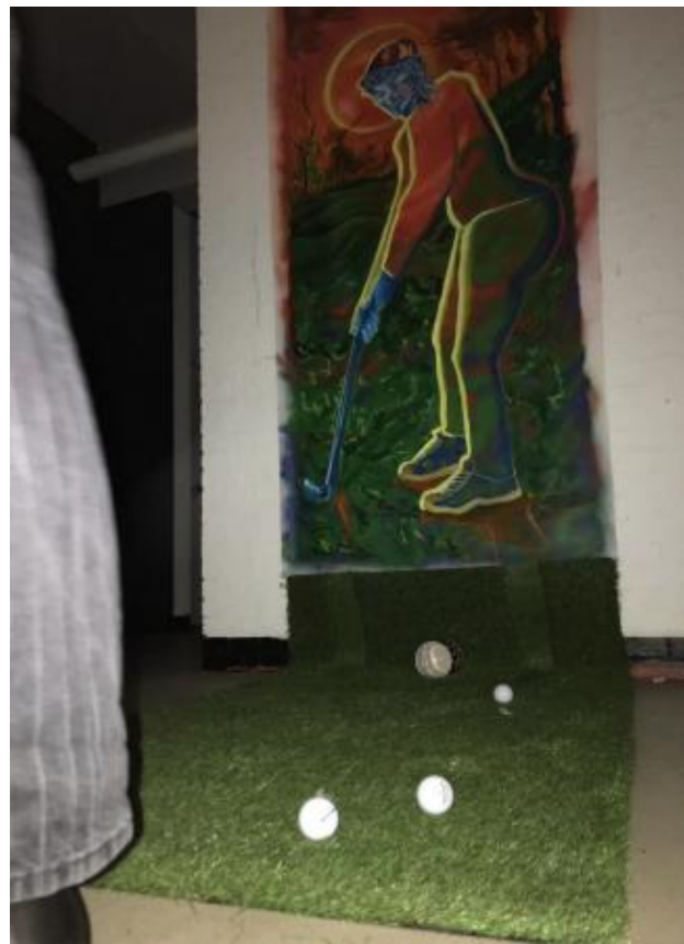
Gol(D)f, 2021 oil on canvas , 200 cm x 50cm