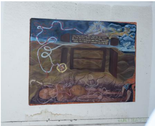
The End of the World , 2022 Oil on Canvas , 100 cm x 130 cm