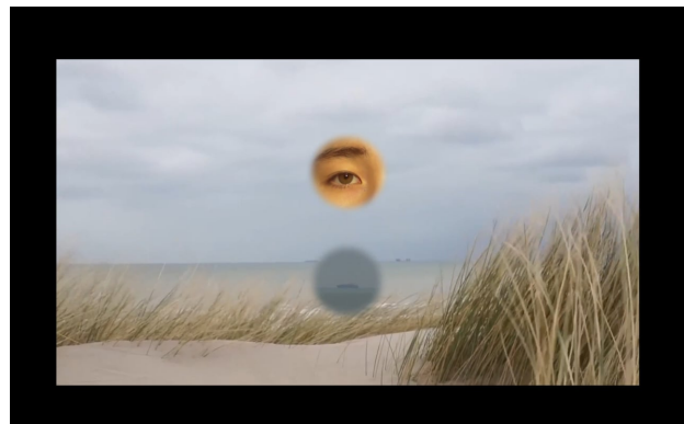
I don't want to speak english anymore , 2020 7:44