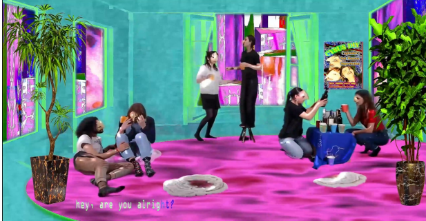
The Unfortunate Promise of CYRUS DIY, 2021 11:25