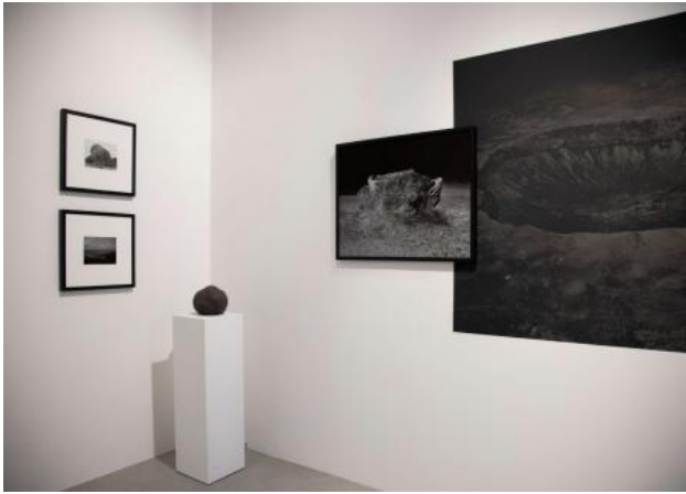
Dior x Luma award exhibition, 2024

Fine art photographic prints in wooden frames, fine art photographic wallpaper, sound installation with a ceramics "murmuring rock" sculpture and a sound piece playing on a loop from inside the rock.