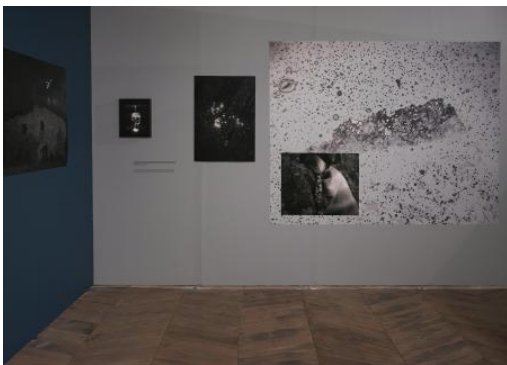
Fotofestiwal Łódź, 2025