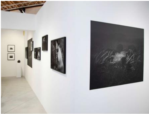
Dior x Luma award exhibition, 2024

Fine art photographic prints in wooden frames, fine art photographic wallpaper, sound installation with a ceramics "murmuring rock" sculpture and a sound piece playing on a loop from inside the rock.