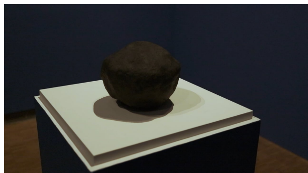
a "humming stone" , 2024 00:41