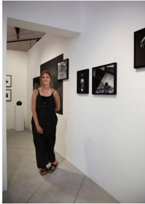
Dior x Luma award exhibition, 2024

Fine art photographic prints in wooden frames, fine art photographic wallpaper, sound installation with a ceramics "murmuring rock" sculpture and a sound piece playing on a loop from inside the rock.