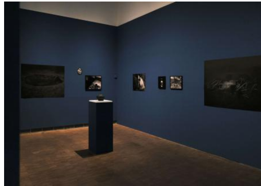
Boutographies festival solo exhibition, 2024

Fine art photographic prints in wooden frames, fine art photographic wallpaper, sound installation with a ceramics "murmuring rock" sculpture and a sound piece playing on a loop from inside the rock.