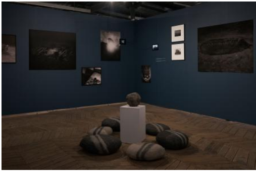
Fotofestiwal Łódź, 2025

tree bearing stones in the place of apples and pears” .