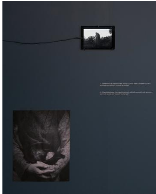
Fotofestiwal Łódź, 2025