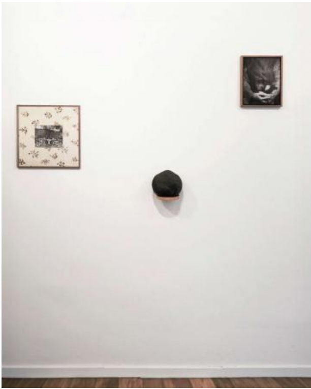
As we drift in the simmering pot things boil under the lid, 2024 hand made pass-partou fine art photographic print in a wooden frame, a photographic fine art print in the wooden frame, a ceramic glazed sculpture with a sound system inside